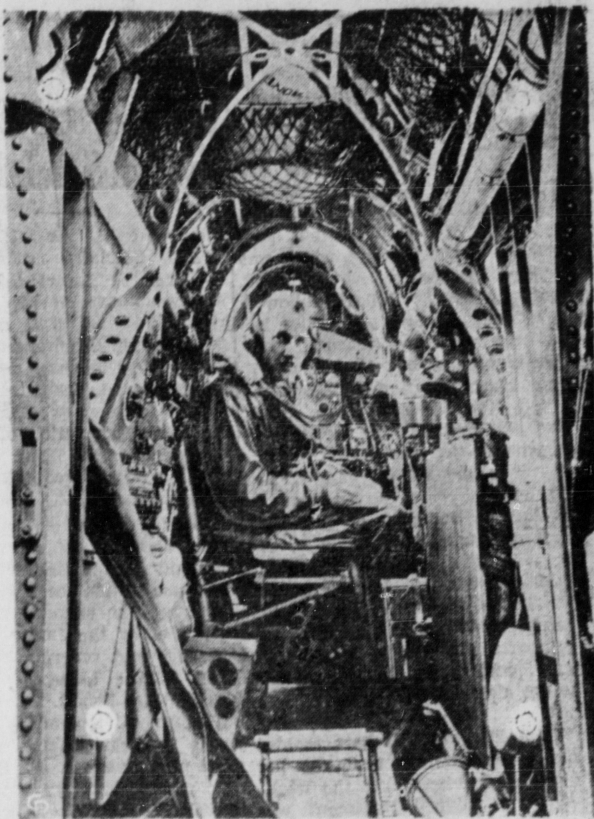
In a well-equipped although somewhat crowded compartment of a British bombing plane, the Royal Air Force "sparks" with earphones cupped over his head, is taking notes from headquarters. The wireless operator is looked upon as an invaluable member of the bomber crew.