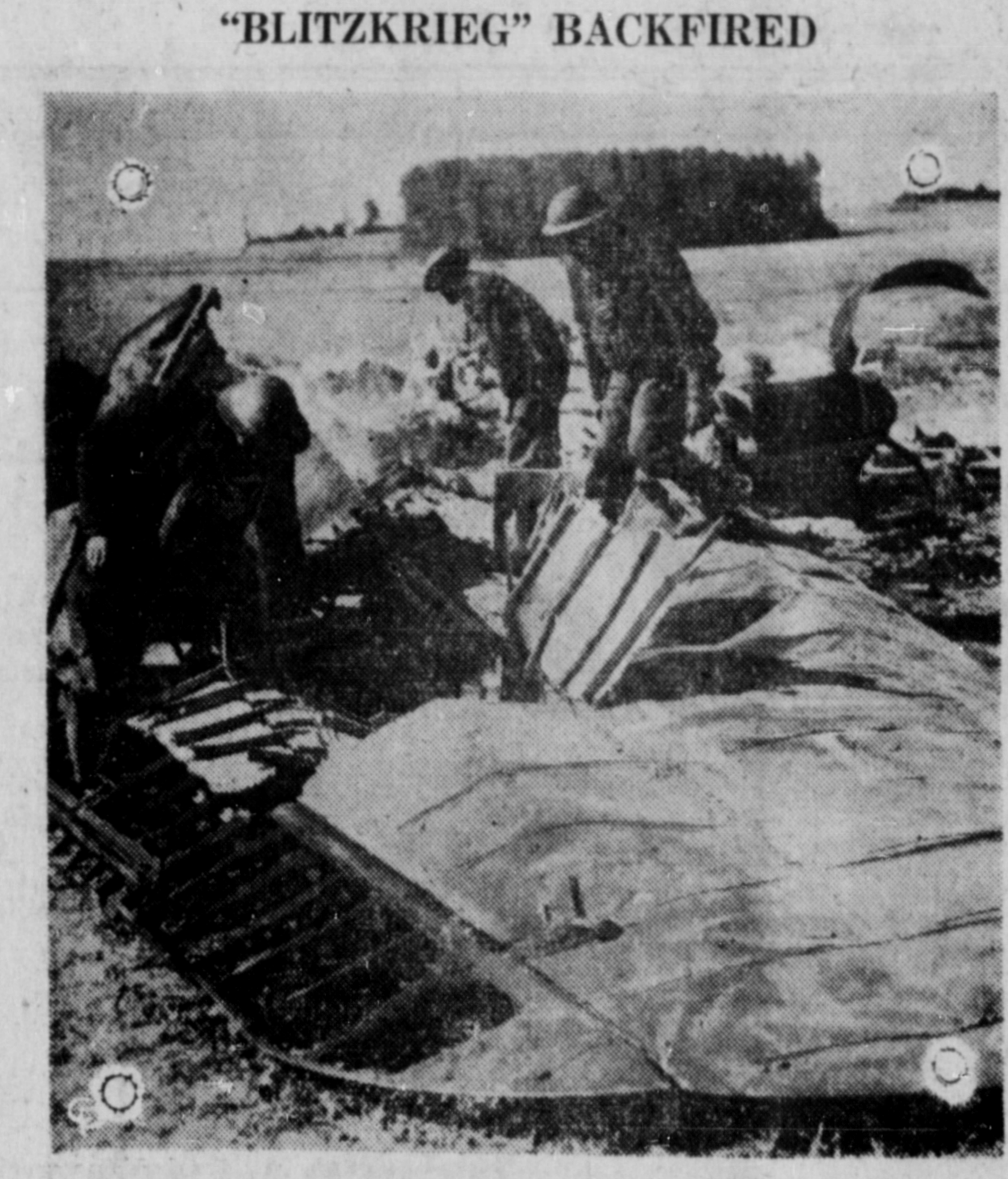
The wreckage of a German Heinkel bomber is searched by Tommies after the plane was brought down by a British anti-aircraft battery.