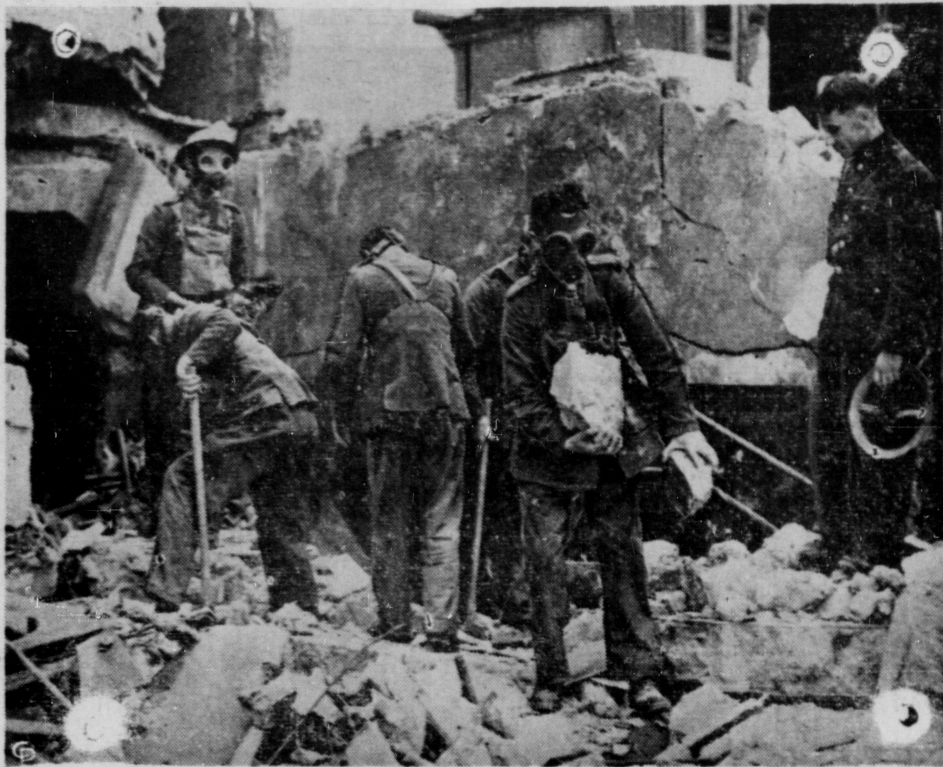
Gas-masked Irish soldiers clear away debris after Nazi bombs fell at Campile, county Wexford, in neutral Eire, wrecking a creamery and killing three girls. Ammonia fumes prompted the soldiers to don masks.