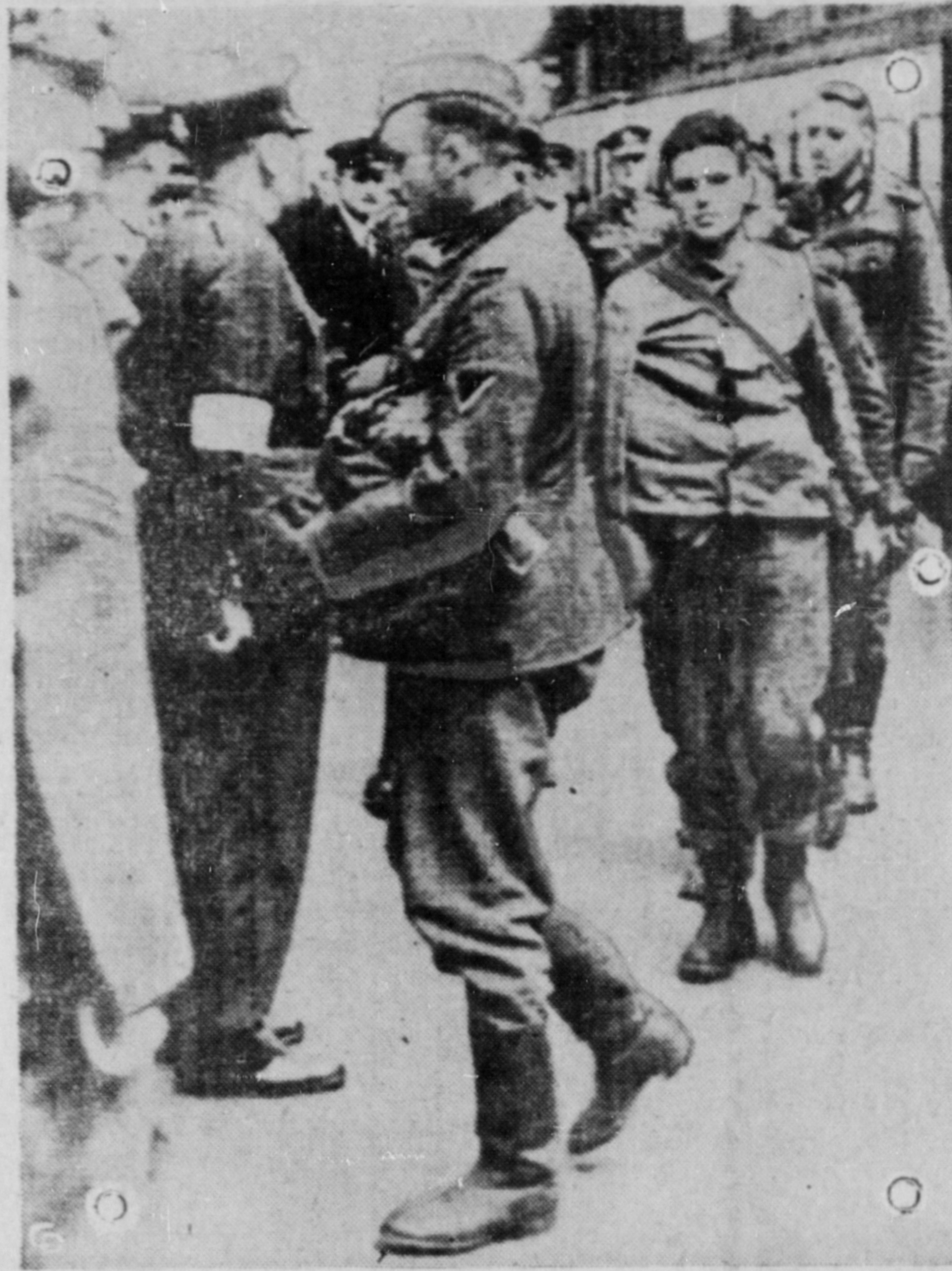
While a crowd watched in grim silence, the first Nazi prisoners from the Belgian war front are shown as they arrived in London. Forty of the prisoners reached London on stretchers. A sergeant of the Scots Guards is shown supervising the unloading of the prisoners, left.