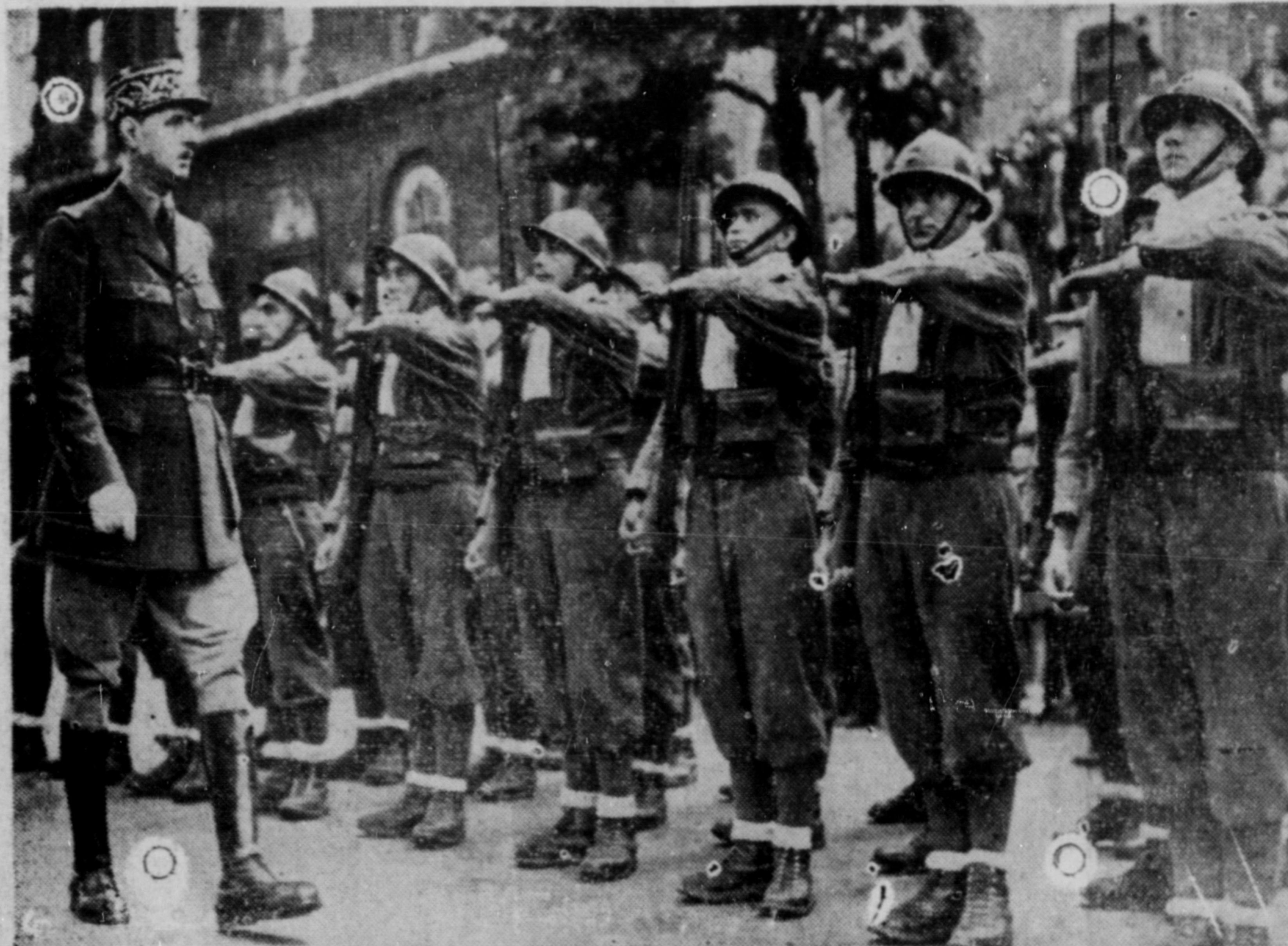
The 14th of July, national holiday of France, was celebrated in London, England, by those "free Frenchmen" who are still defying Adolf Hitler and his Nazis. General De Gaulle, leader of the "free Frenchmen," is shown here inspecting French troops in London on Bastille Day.