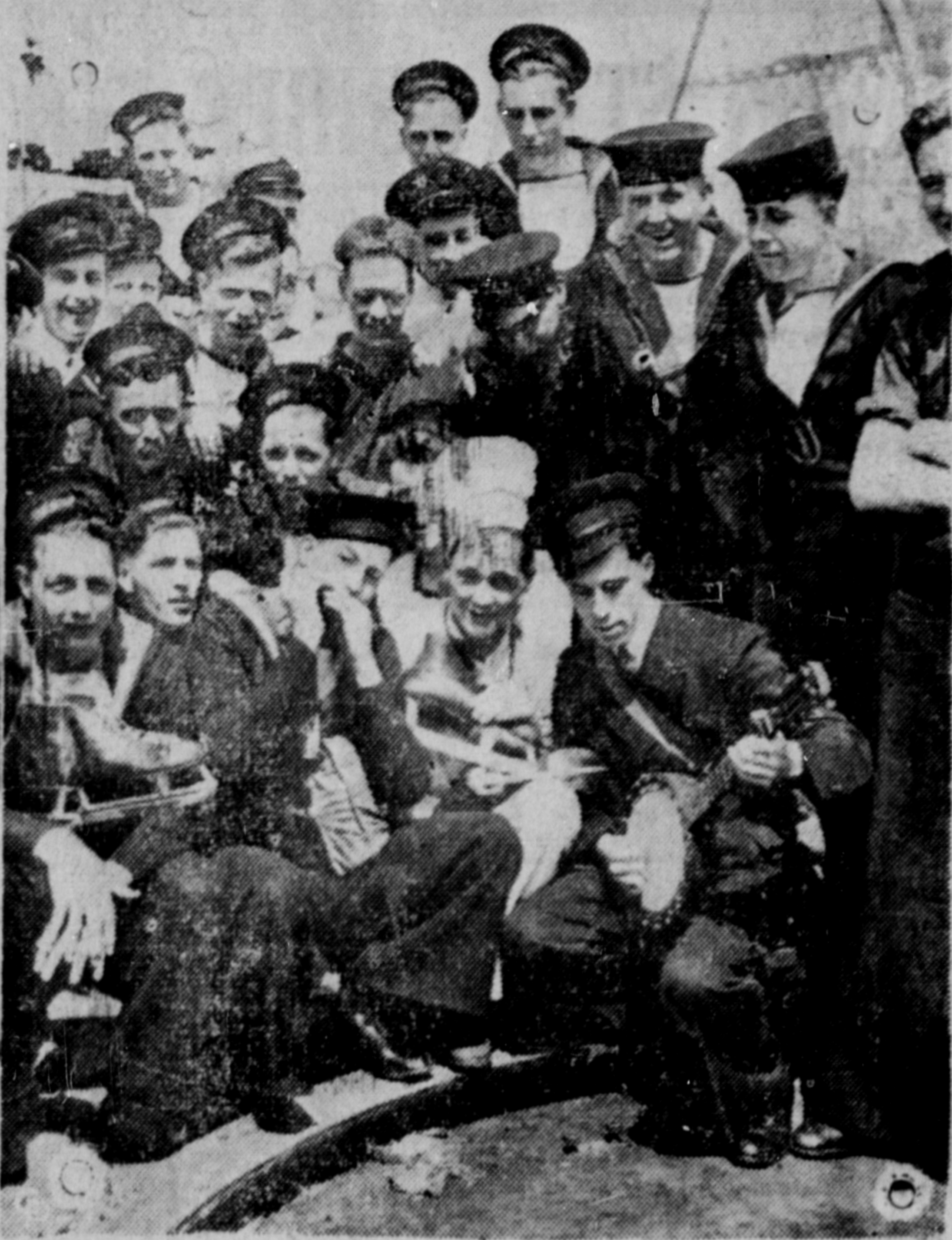
The skating outfits carried by these tars easily identify them as Canadians. These Canadian sailors in England with their ship for duty with the Royal Navy evidently hope for a spot of hockey in off-duty time.