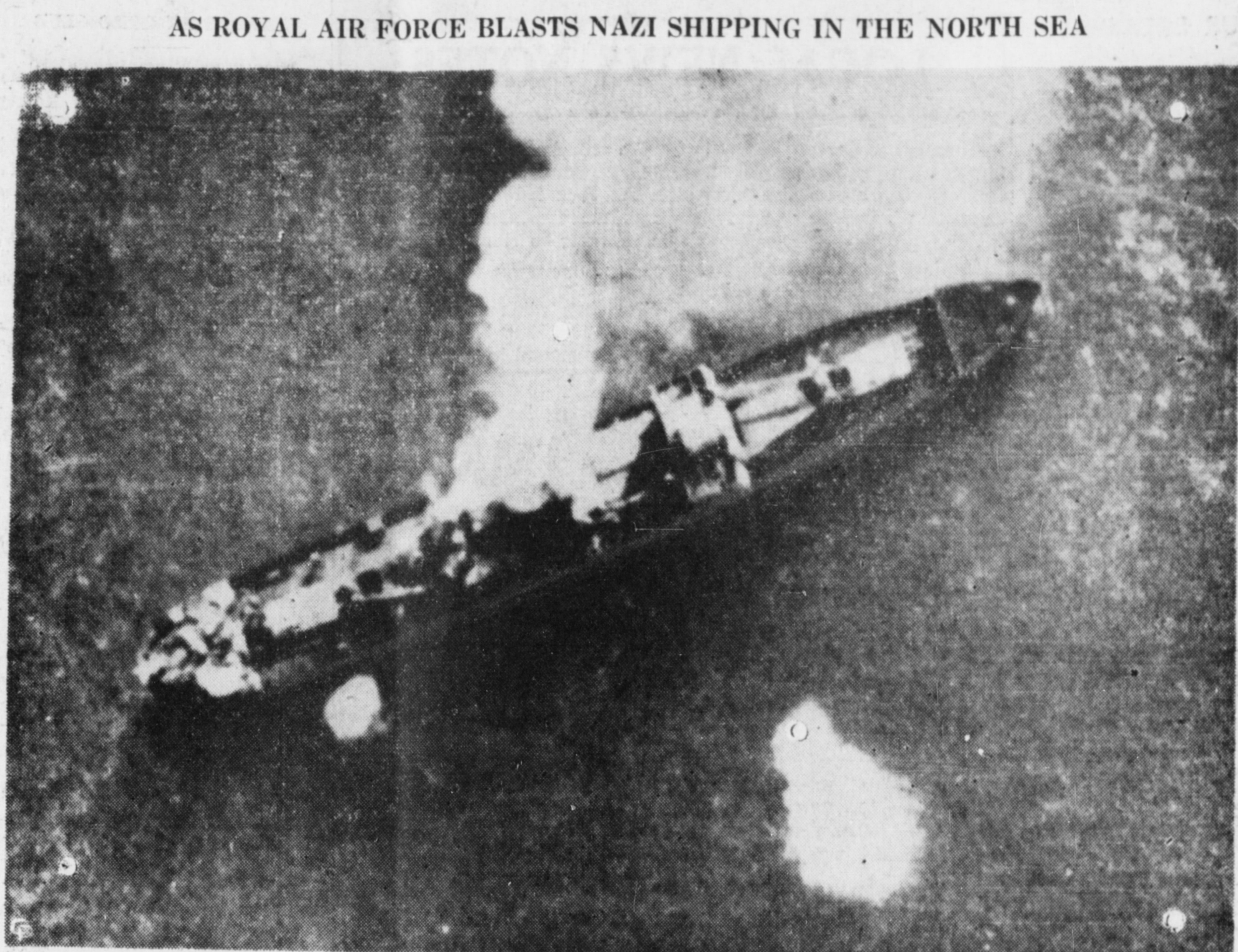
The German supply ship Elbe is shown, above, burning after a direct hit by a British naval plane. Other bombs can be seen sending up geysers of water beside the stricken vessel. When sunk, the Elbe was reported to have been disguised as a Norwegian ship.

FINEST RAZOR BLADES YOU EVER USED . . . OR YOUR MONEY BACK