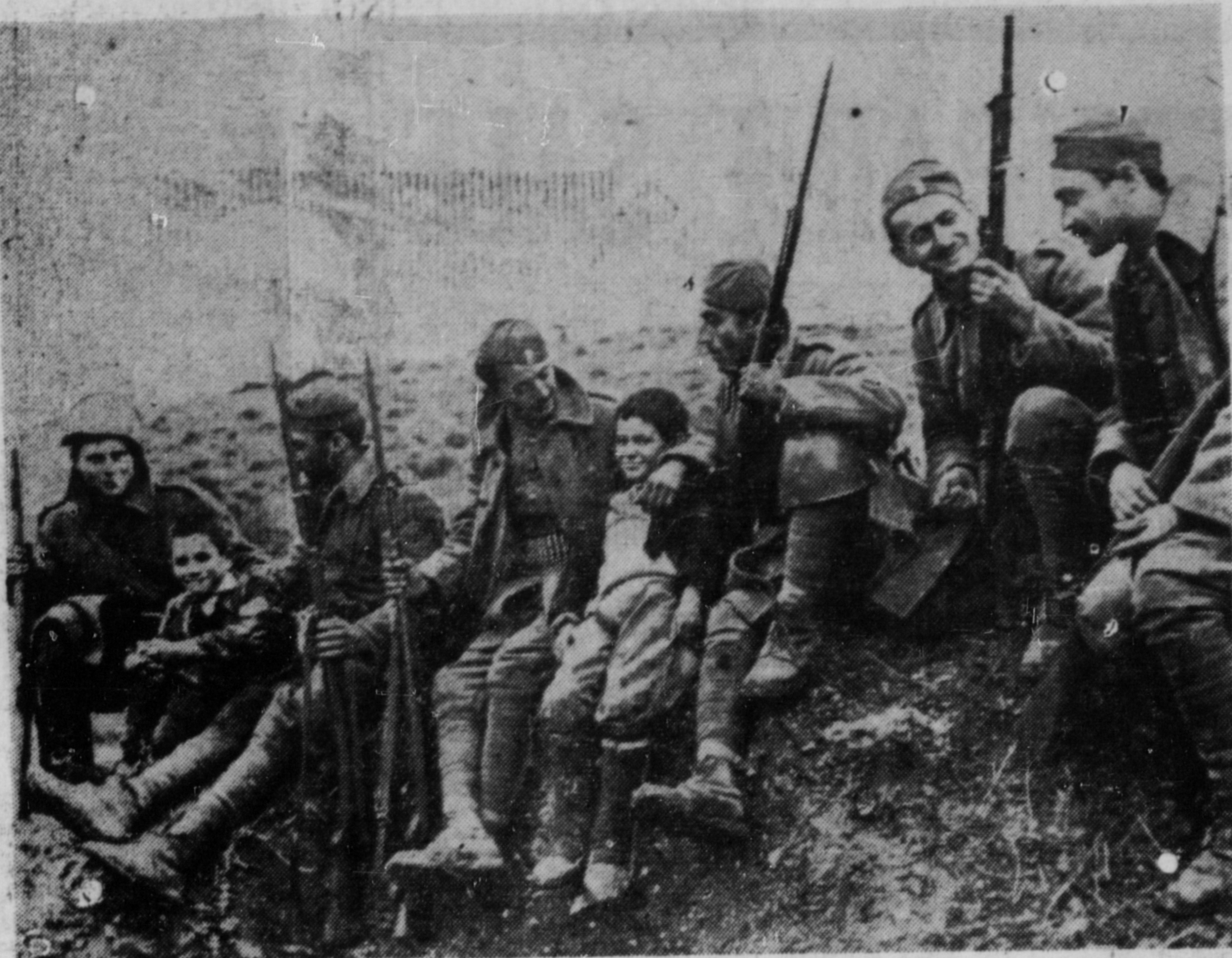
Although threatened now by the senior partner of the Rome-Berlin-Tokyo axis, the Greeks remain undaunted, high in morale and determined to defend their country against all aggressors. Albanian boys indulge in a little hero-worship with a group of Evzones, the hardy fighters who wear ballet costumes in peace times but who showed that they were no "sissies" when it came to chasing invaders halfway back to Rome.