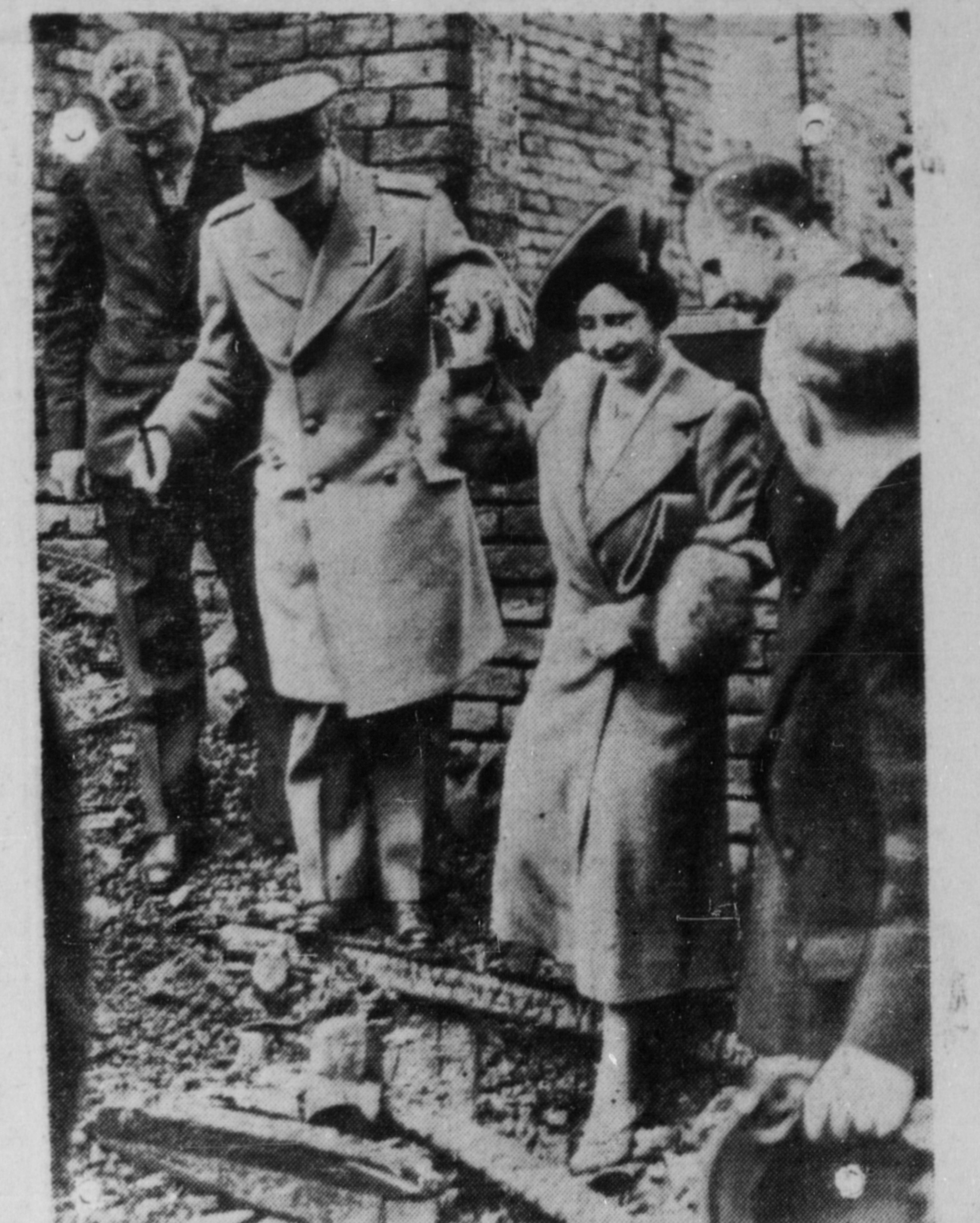
Hand in hand, King George and Queen Elizabeth pick their steps through the debris and charred timbers left after a German bombing raid on Salford, Lancashire. The royal couple make it their business to visit many of the towns punished by Nazi raiders.