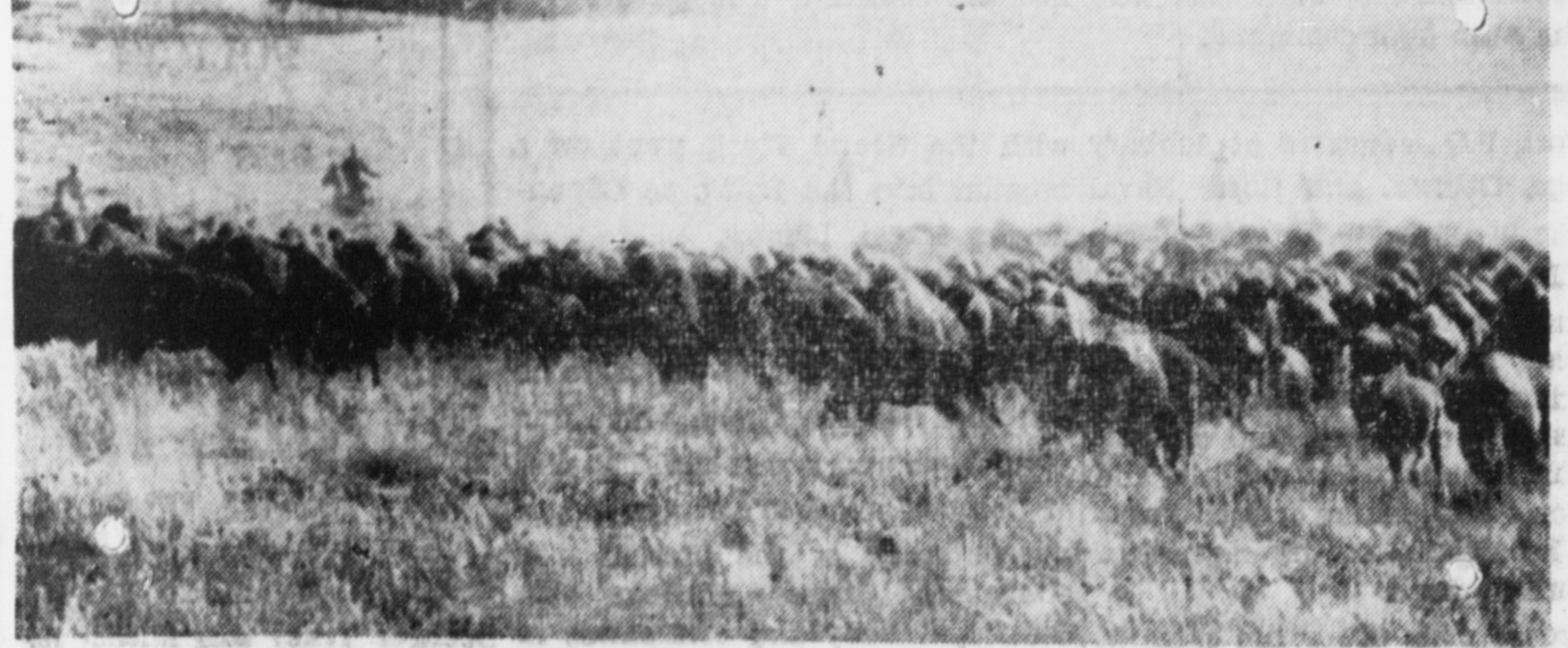
Canadian buffalo, from the reserve at Wainwright, Alberta, are being shipped to another point. Top picture shows cowboys rounding up a herd. Below, buffalo being herded into cars.