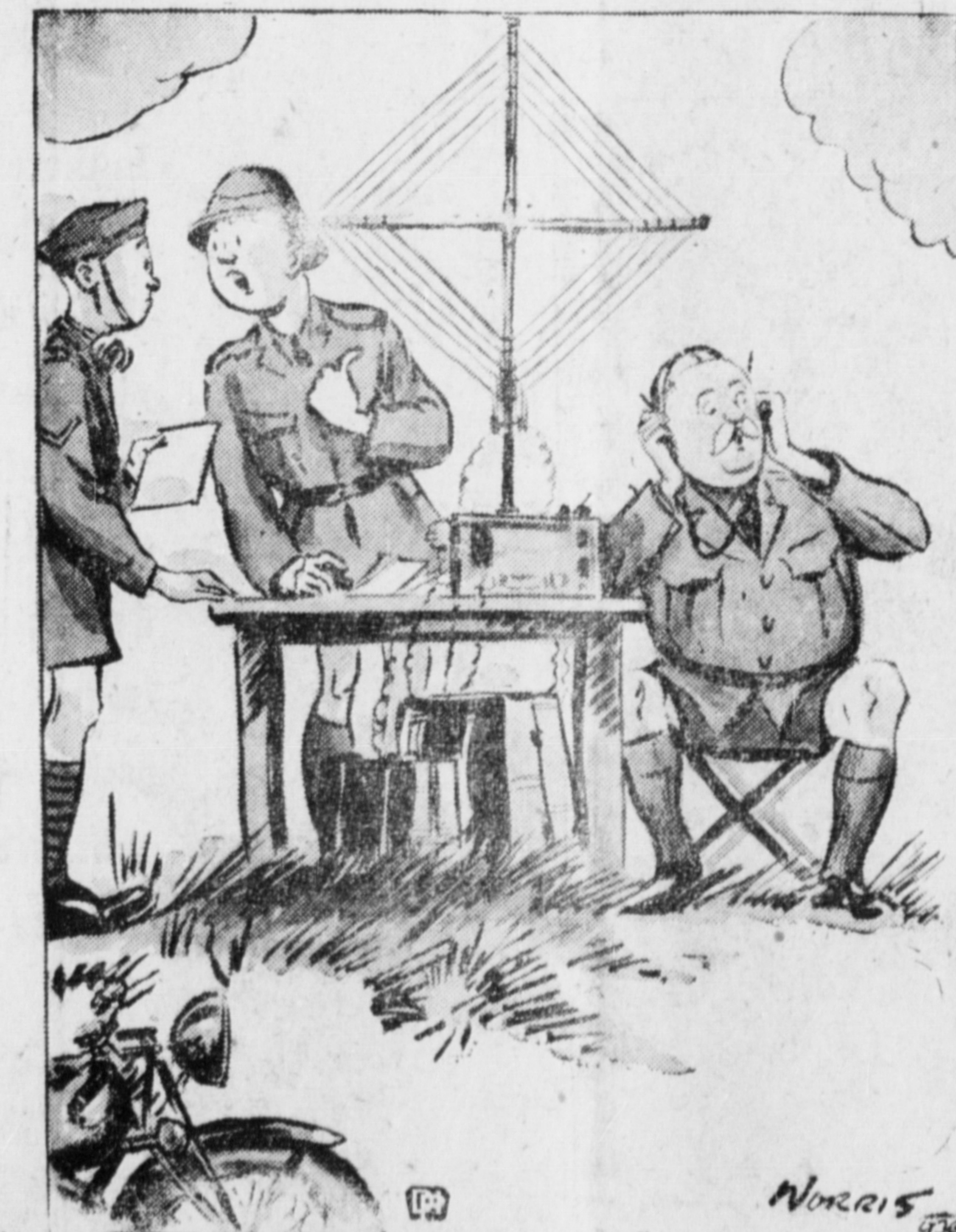
"Sorry—I can't take a message for fifteen minutes. The colonel's listening to Superman!"

Packed by the only salmon canning company with an all-the-year-round payroll in Prince Rupert.