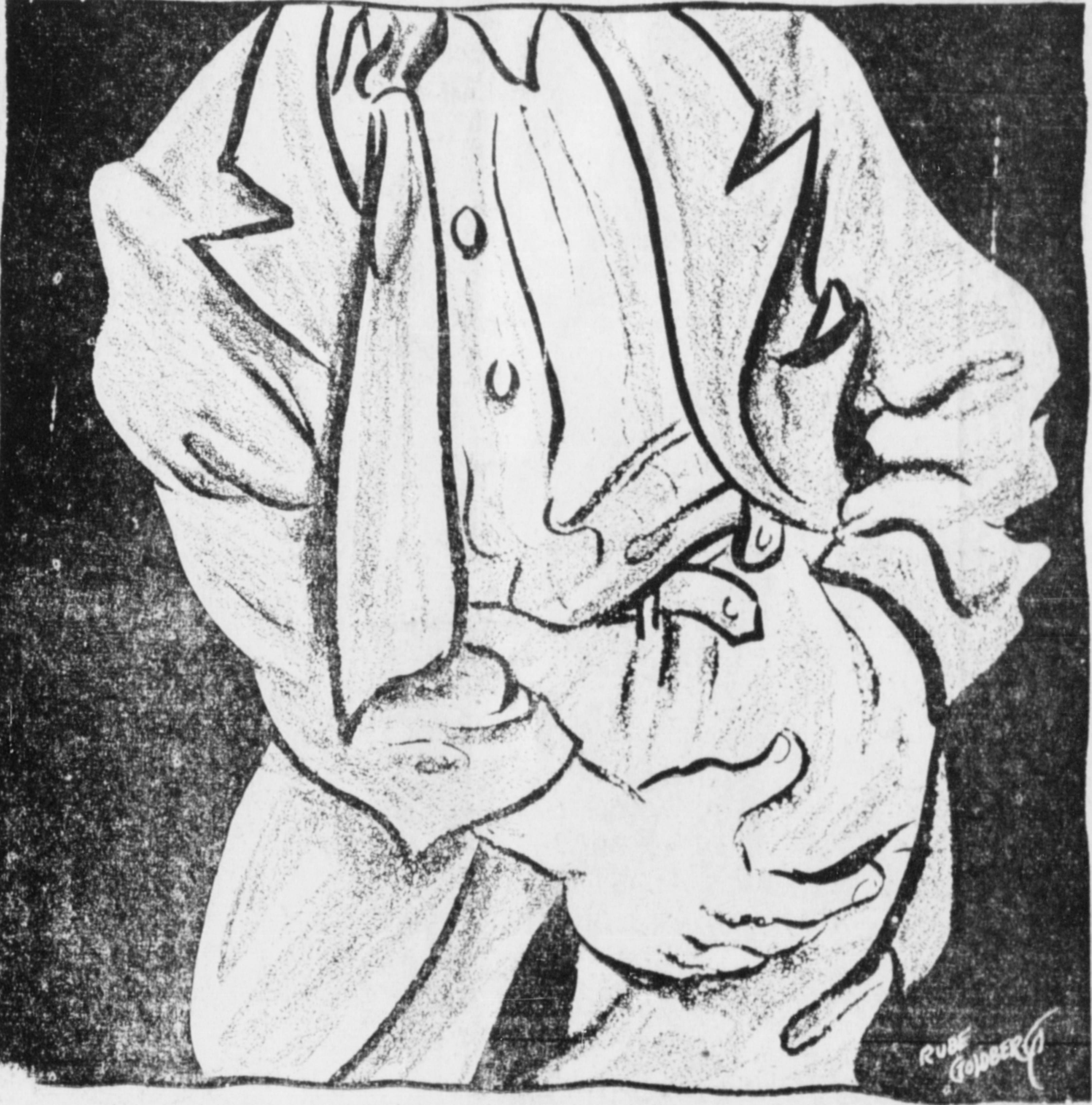
Contributor to the Victory Loan Campaign by Rube Goldberg internationally known cartoonist of the New York Sun.