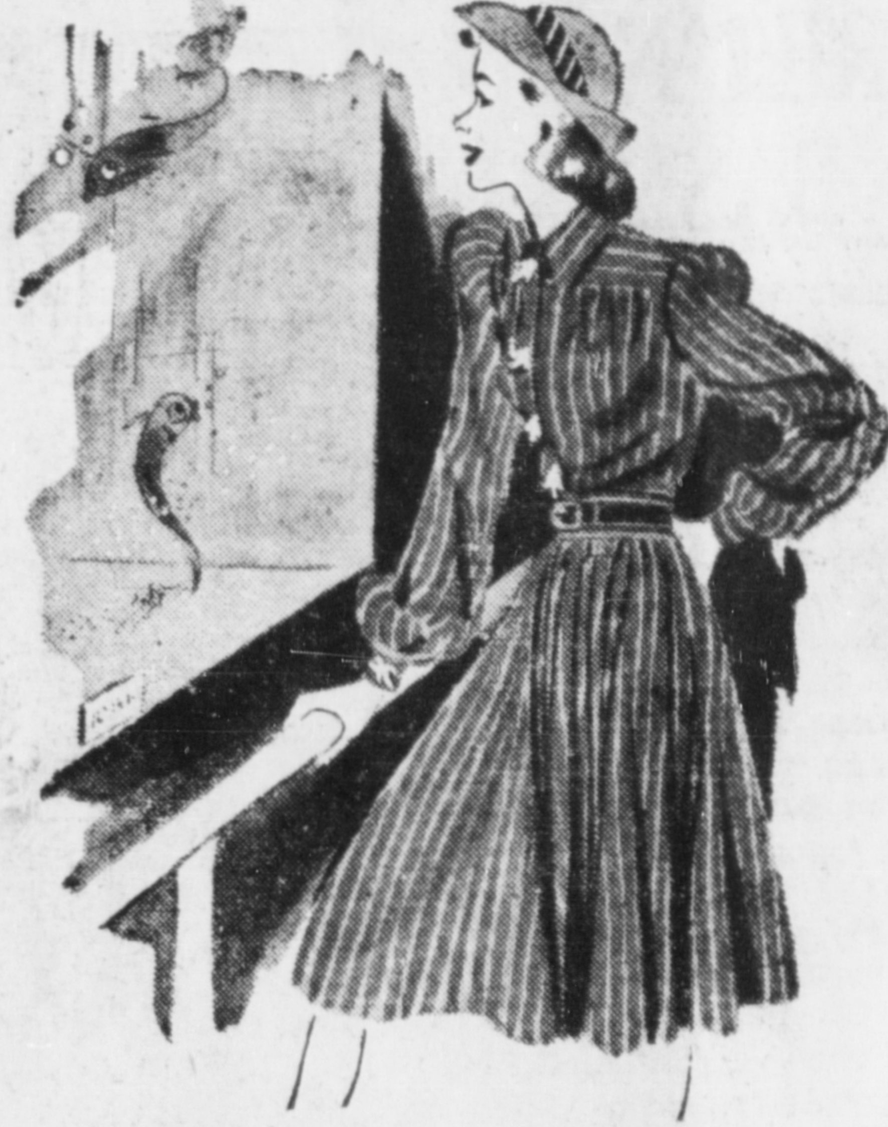
Sports dress with Bishop's Sleeves