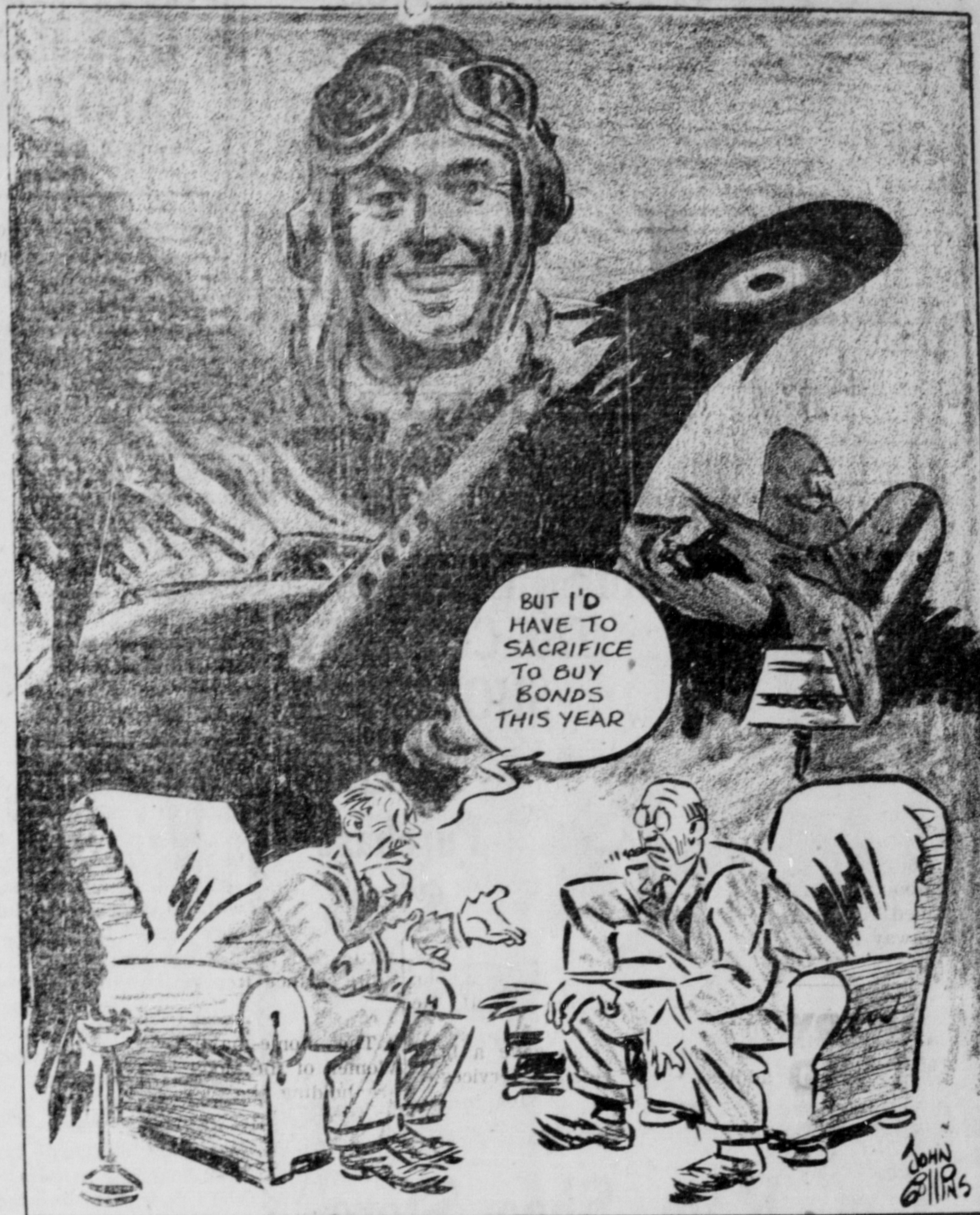
HE DIDN'T COUNT THE COST

LOS ANGELES, Oct. 13 — Dim-out regulations for the coast of California are being extended to reduce the volume of short glow and minimize the resultant light to submarines.