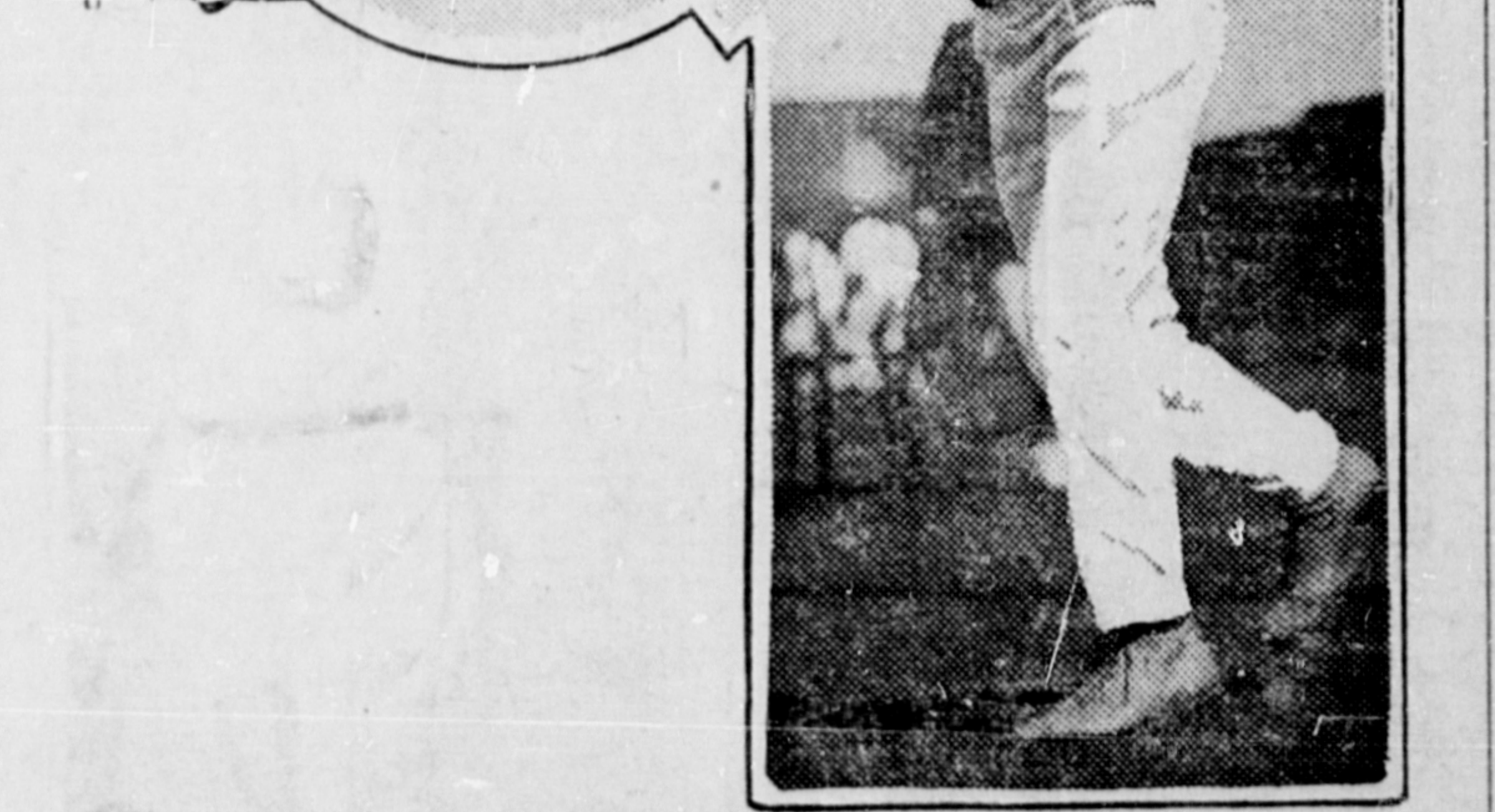
W. A. LARNED

Kilbane's Mascot. Johnny Kilbane, the featherweight champion, who won his crown by defeating Abe Attel, is