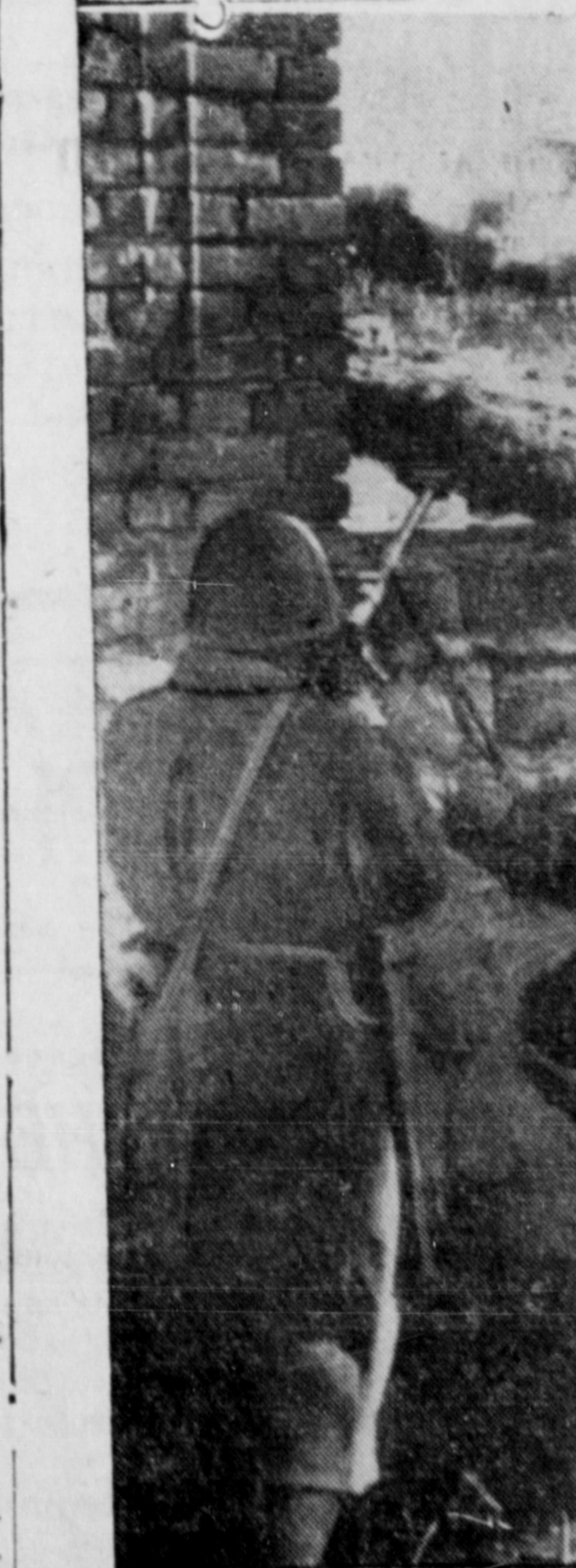
A Red army tank destroyer is shown in action smashing Nazi tank attack in a war-wrecked town somewhere in Russia.