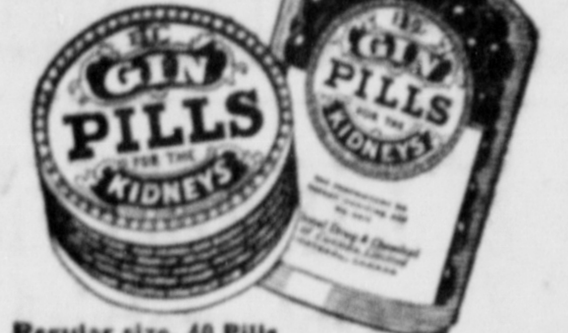
Regular size, 40 Pills Large size, 50 Pills (In the U.S. ask for "Gino Pills")

Sluggish kidneys often cause lame back. Gino Pills—the old reliable kidney remedy—will help this condition. Sold on a money back basis.