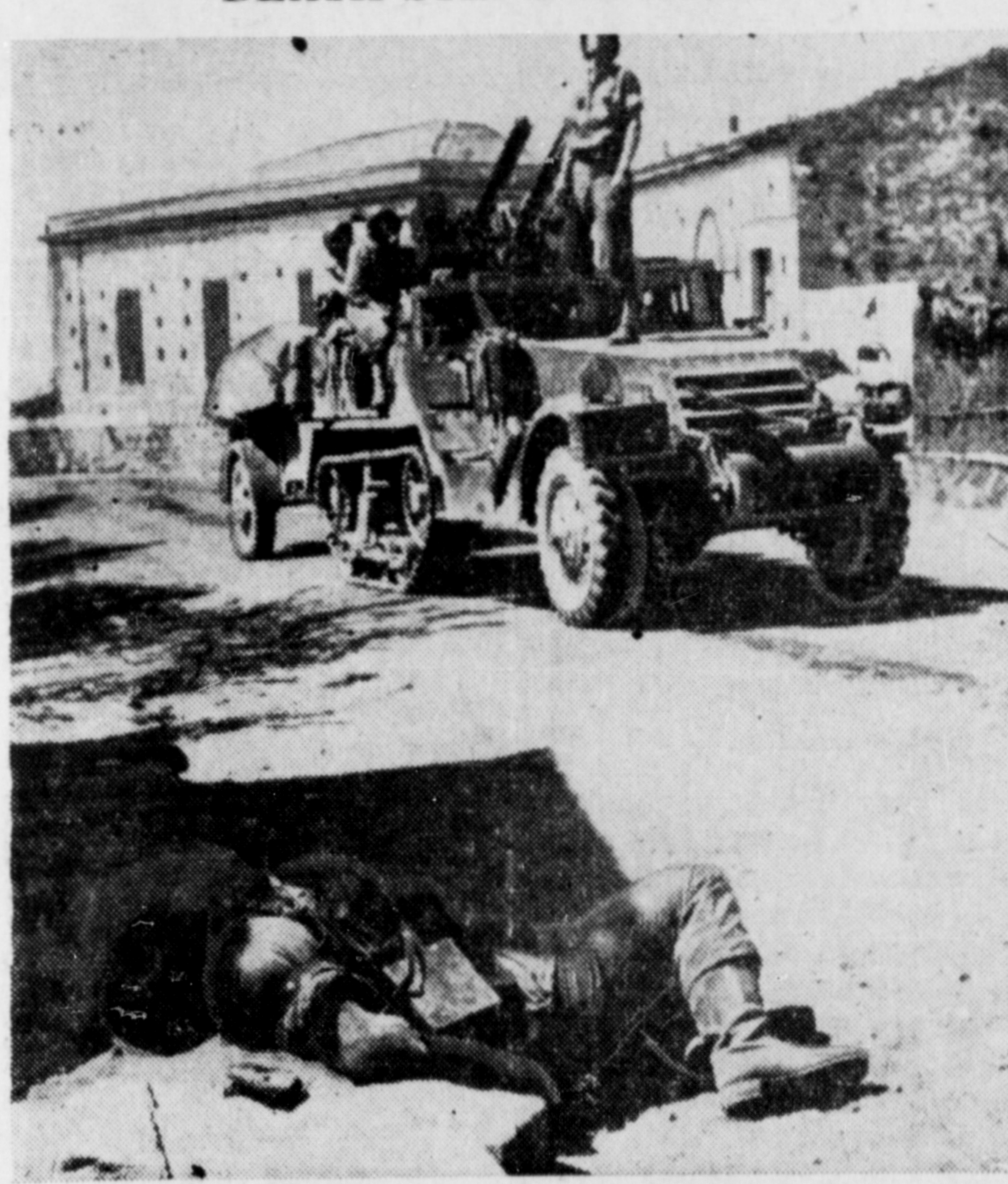
This photo shows a dead Nazi lying where he fell in the street as the remains of the fleeing Nazi troops retreated. A U.S. mobile unit rolls into the town, their eyes turned skyward on the alert for enemy planes.

"We are in the midst of another very strenuous summer sports program... track and field, tug-of-war, softball, volleyball and horseshoes are the official summer sports. Last week in our own formation we had four track and field meets involving whole service groups... a few weeks ago we had golf championships... many of the tournaments were like 'old home week' with golfers from all over Canada meeting one another again... we have had some very interesting games of softball with the Americans here in England. One game was held for a Wings for Victory Campaign in an English town. We arranged certain compromises on rules to allow for the difference between ours and the Americans. I think we received quite a shock when the American boys came on the field with black trousers or knickers with yellow socks up to the ankles, gaudy yellow shirts and powder blue peak caps. The shock didn't affect our game and we won handily. The local people presented each member of both teams with an original horseshoe won by an English Derby winner. In addition we were presented with a cup. In a later game we were privileged to enjoy American hospitality... there were huge crowds at both games. 'Mr. Mayor' and 'Mrs. Mayor' were the guests of honor and the former made a little speech on each occasion. The Mayor and his wife hold