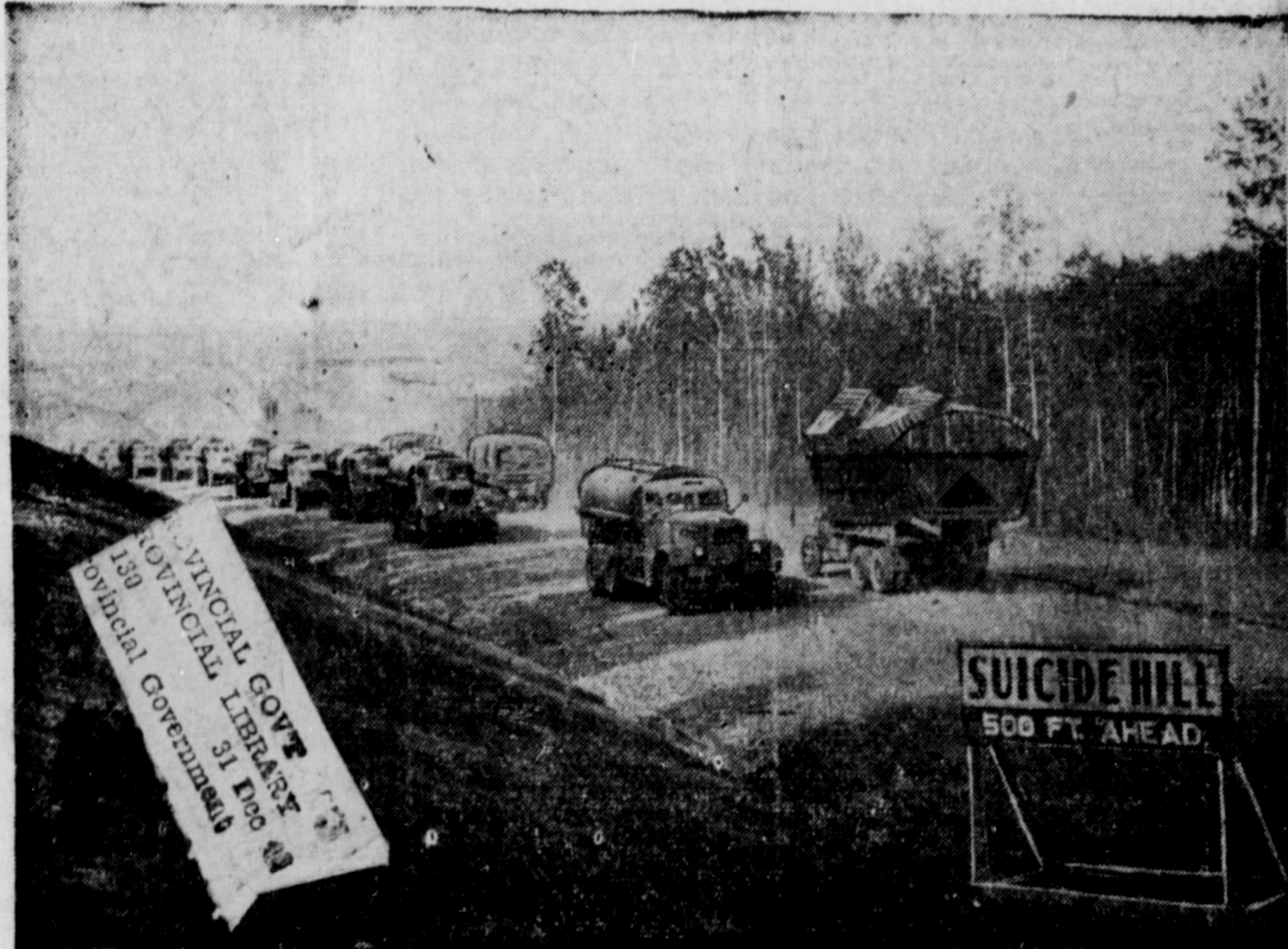
Over the gravelled surface of the Alaska highway huge convoys of trucks travel daily carrying oil, as shown above, and other vital supplies bound for Alaska and battle fronts beyond. Picture at right shows the giant new span which bridges the wide banks of the Peace River. It is now in use.