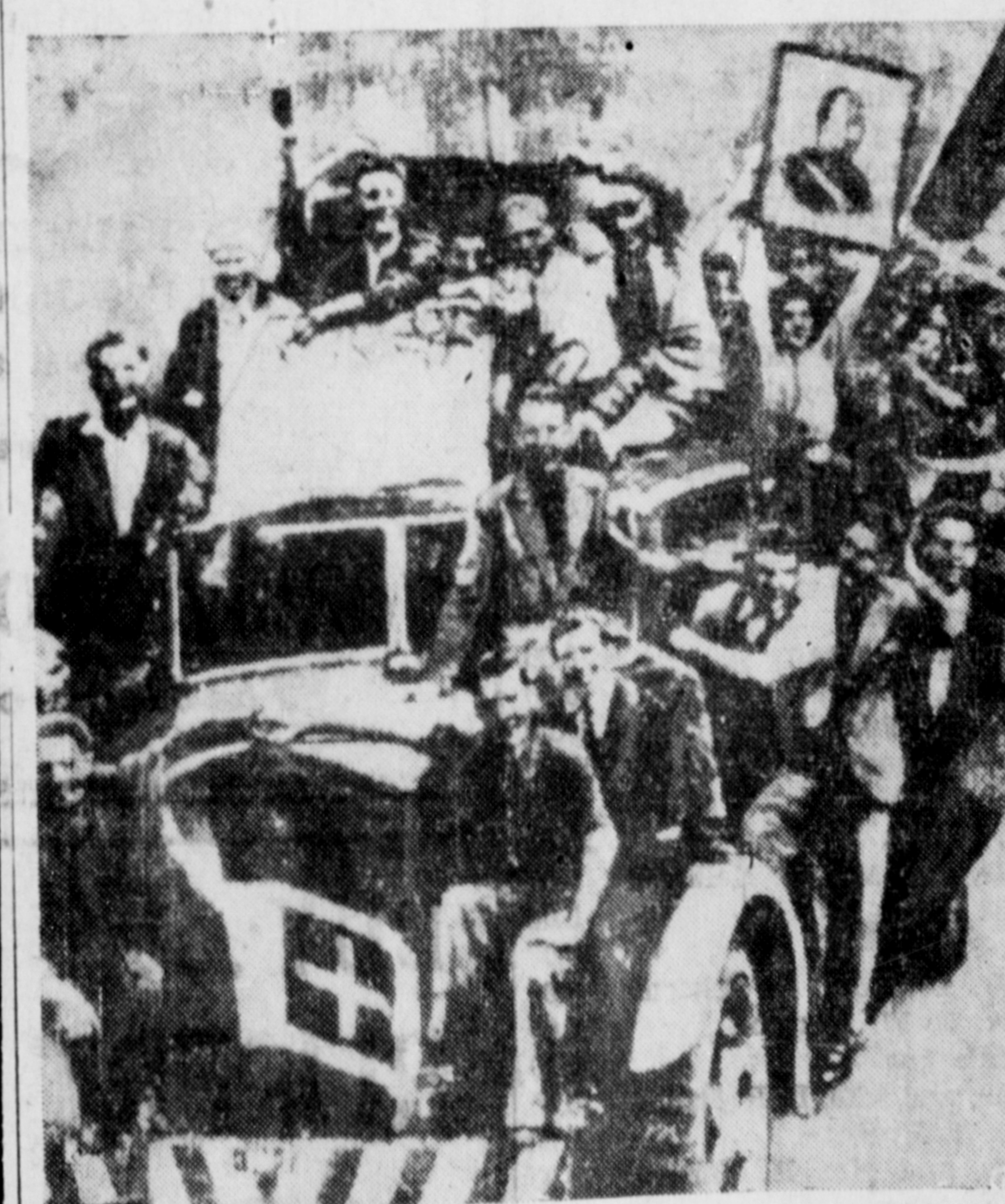
Italians, some in trucks, others on foot, but all participating in the gala anti-Fascist celebration are pictured "voicing" their enthusiasm in Rome. Note the picture of Marshal Badoglio held high.—(Radio photo.)