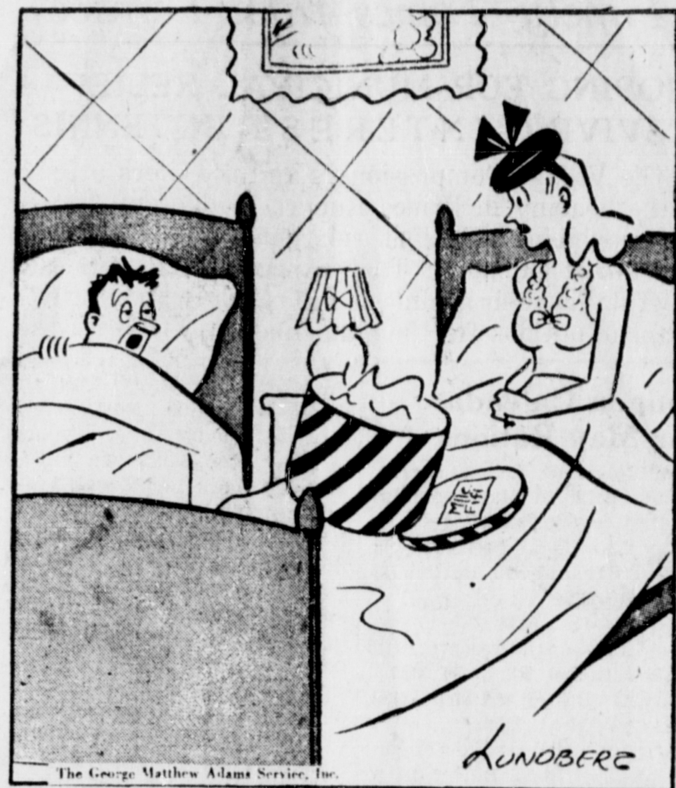
The George Matthew Adams Service, Inc.

"OK, it's lovely. Now can I go to sleep?"