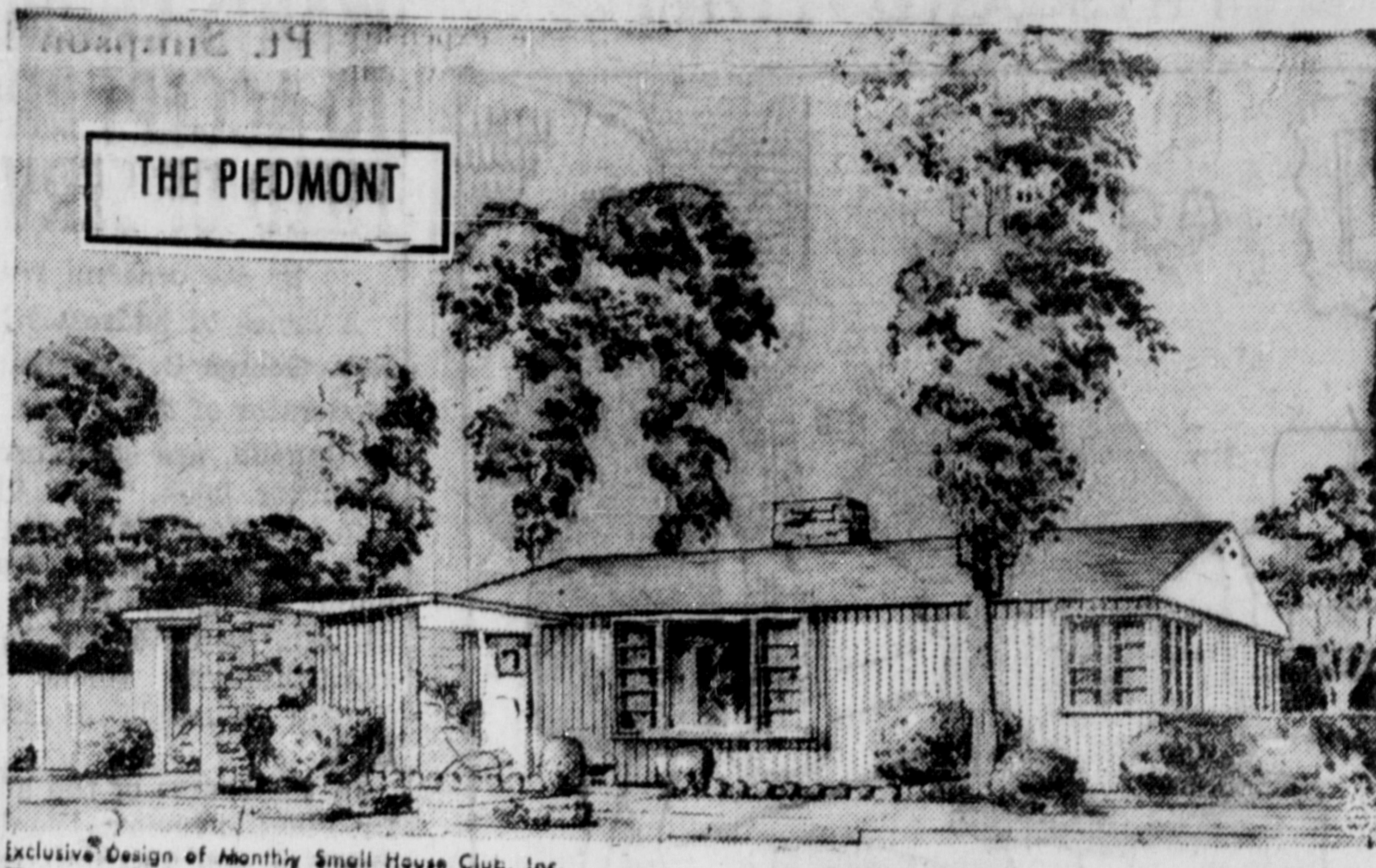
Inclusive Design of Monthly Small House Club, Inc.

Pine hout the tip of leading branch when five inches high. When danger of severe freezing is over, you can keep them in the cold frame until time to set in the garden.