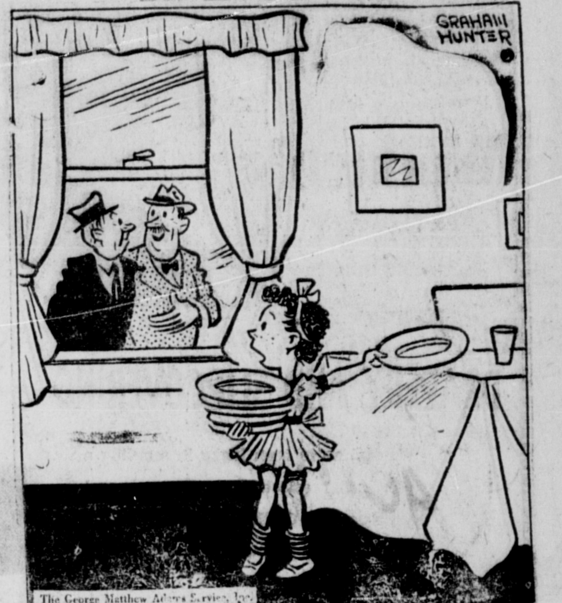
"Hey, ma! Pop's bringing company. Want me to switch to the small size plates?"