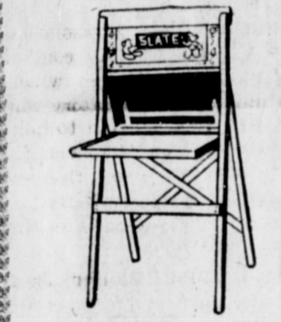
$2.95 and $4.25