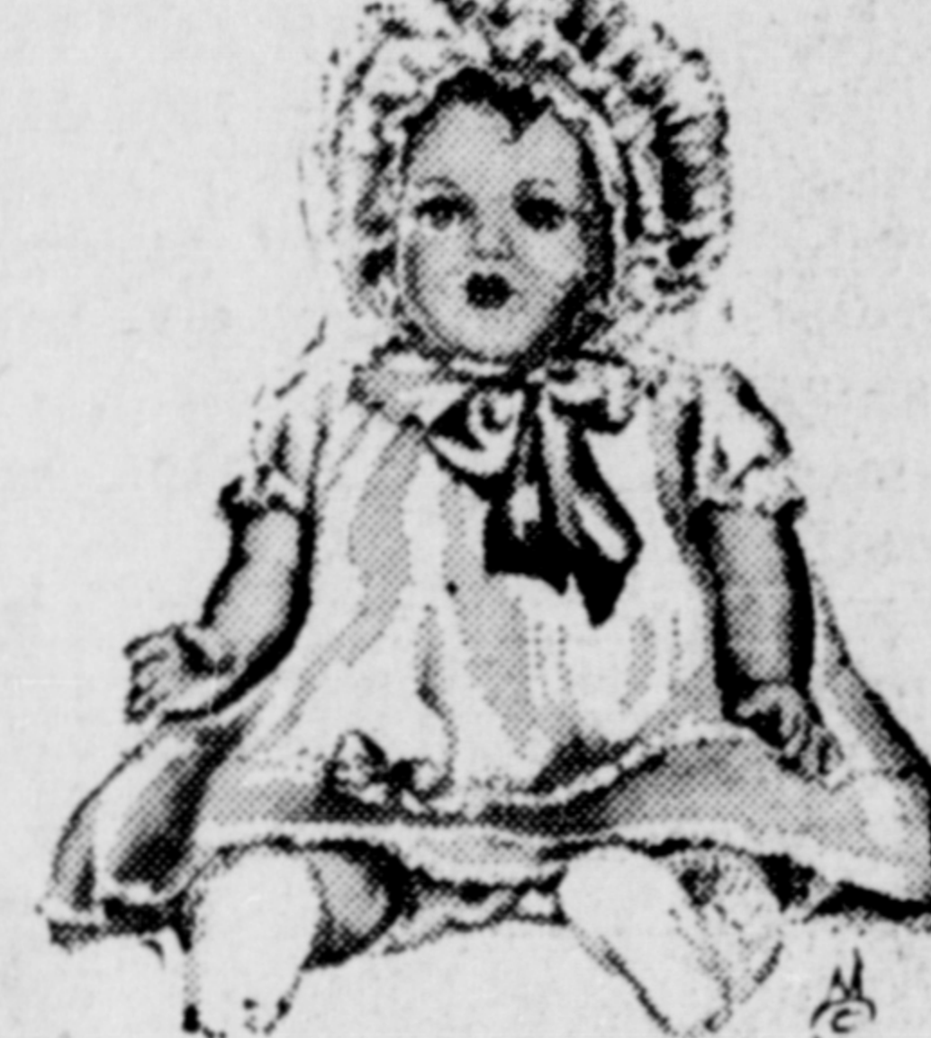
$1.75 to $6.75