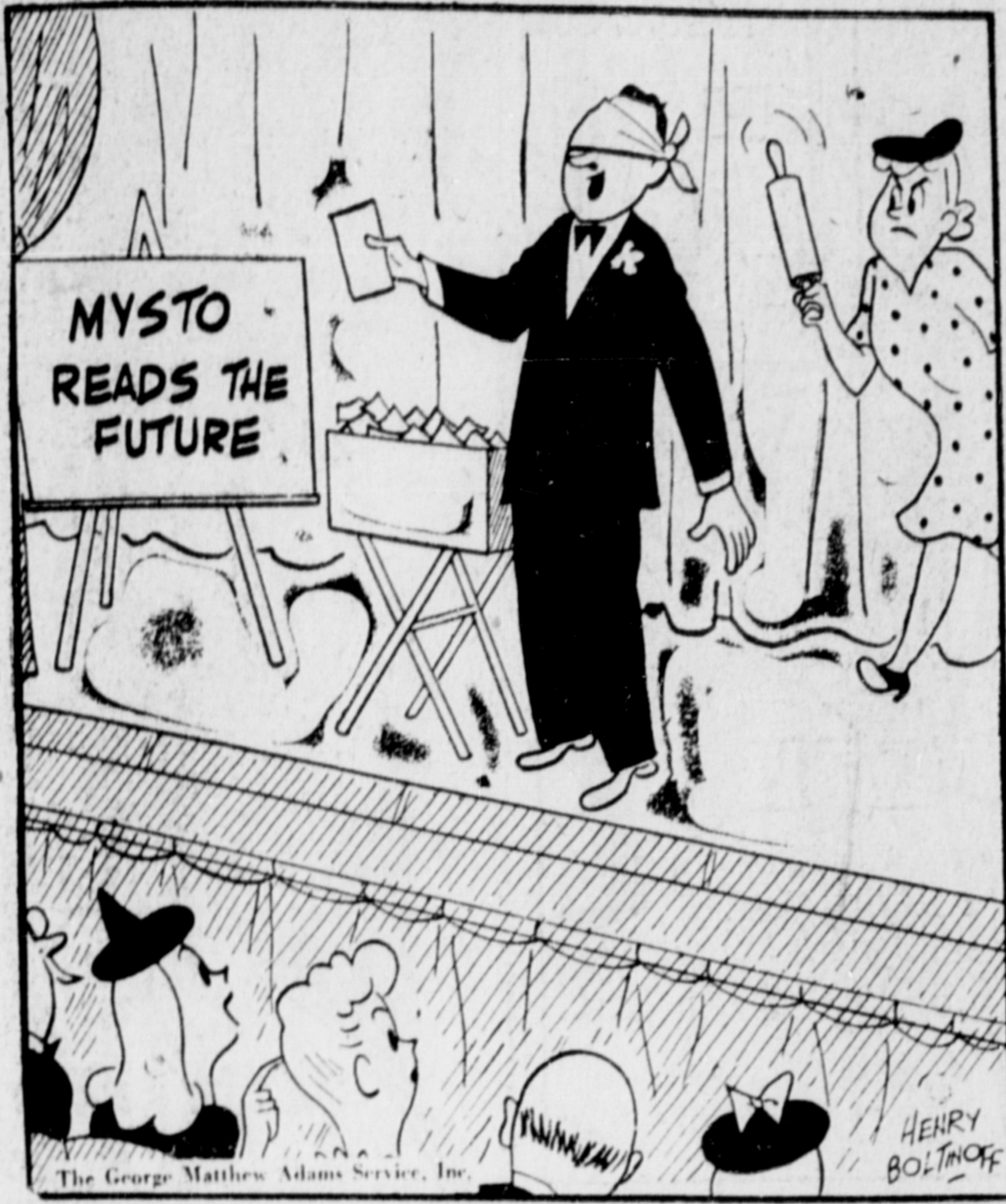
"See, I knew he was a fake!"