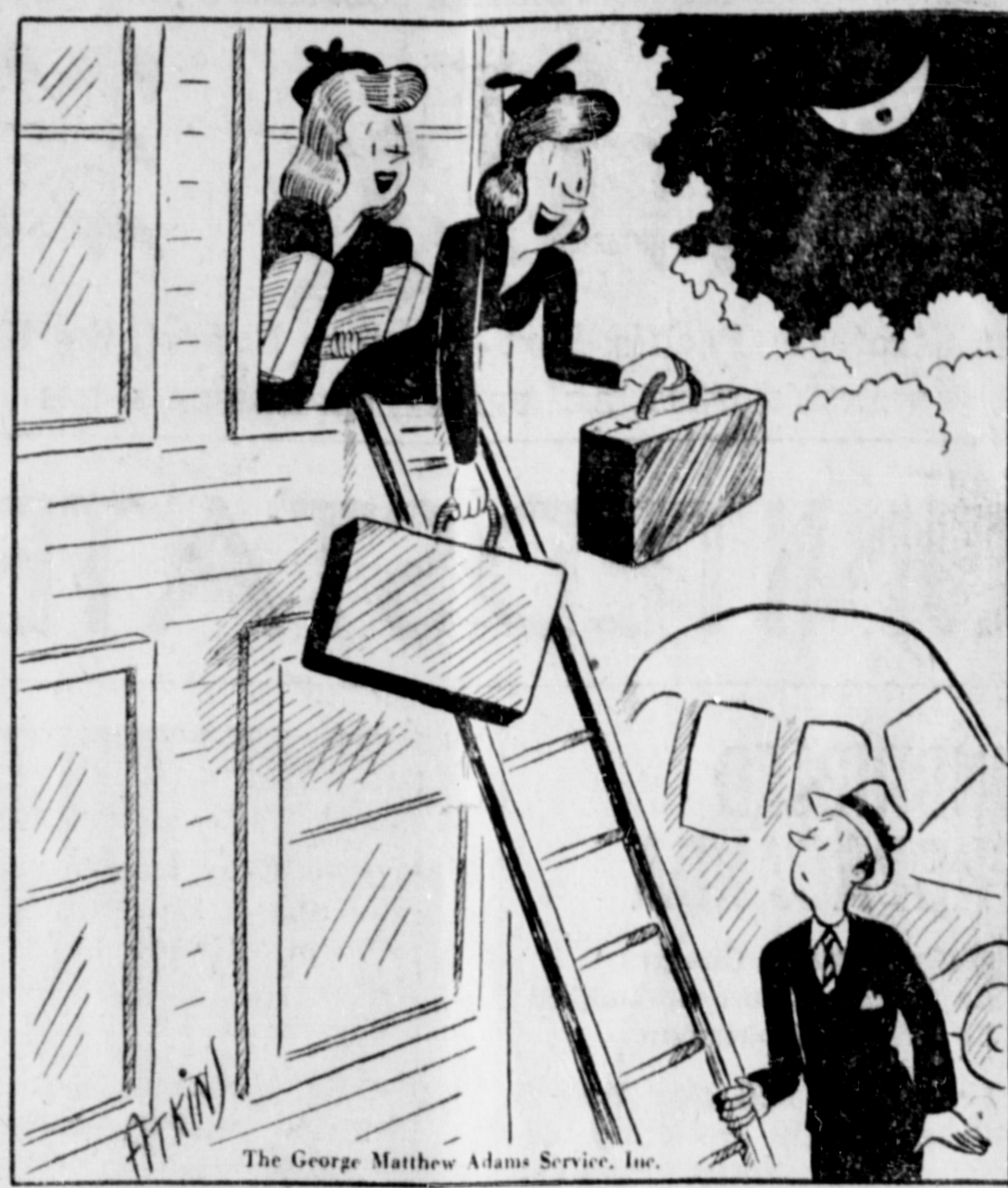
The George Matthew Adams Service, Inc.