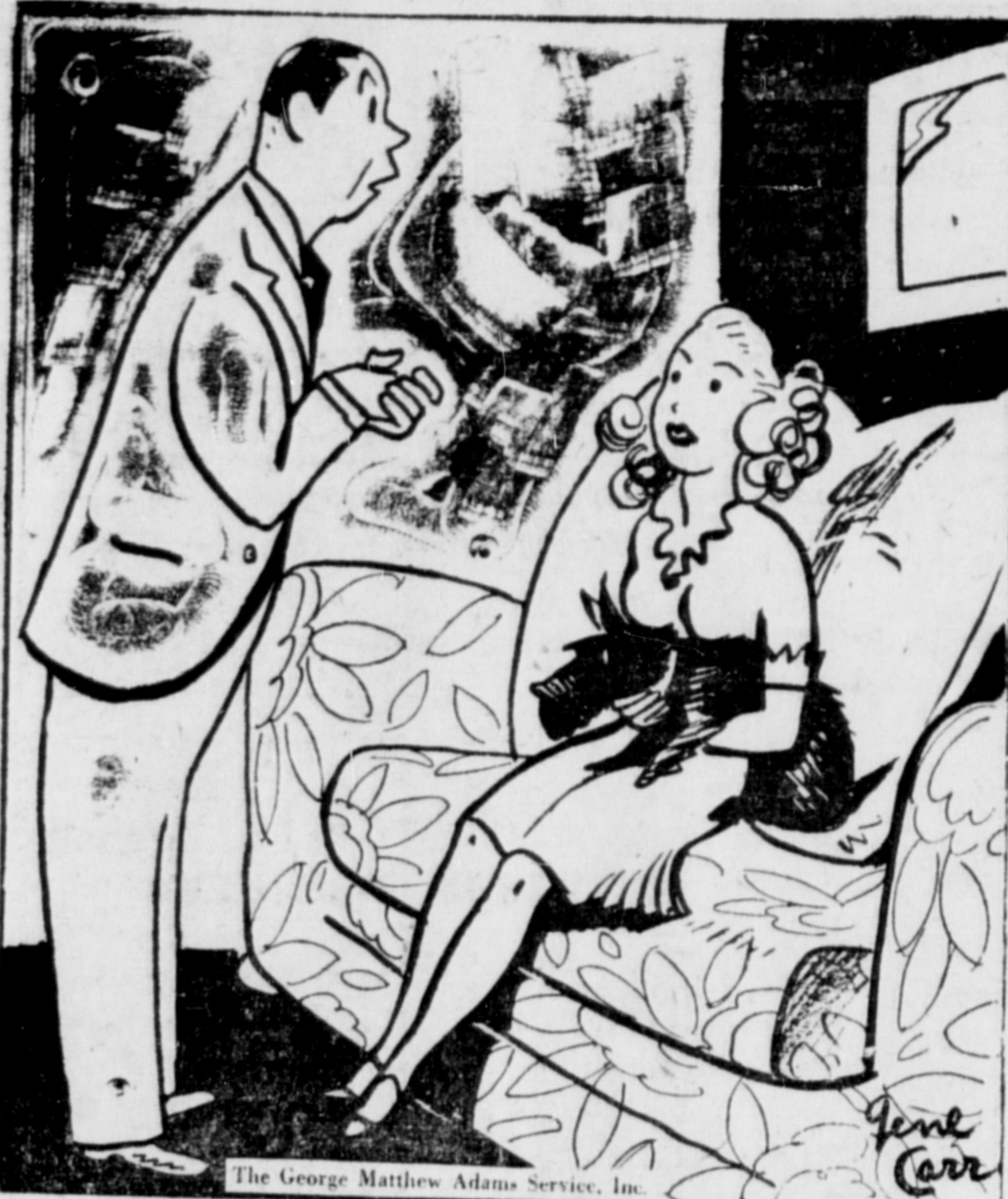
The George Matthew Adams Service, Inc.