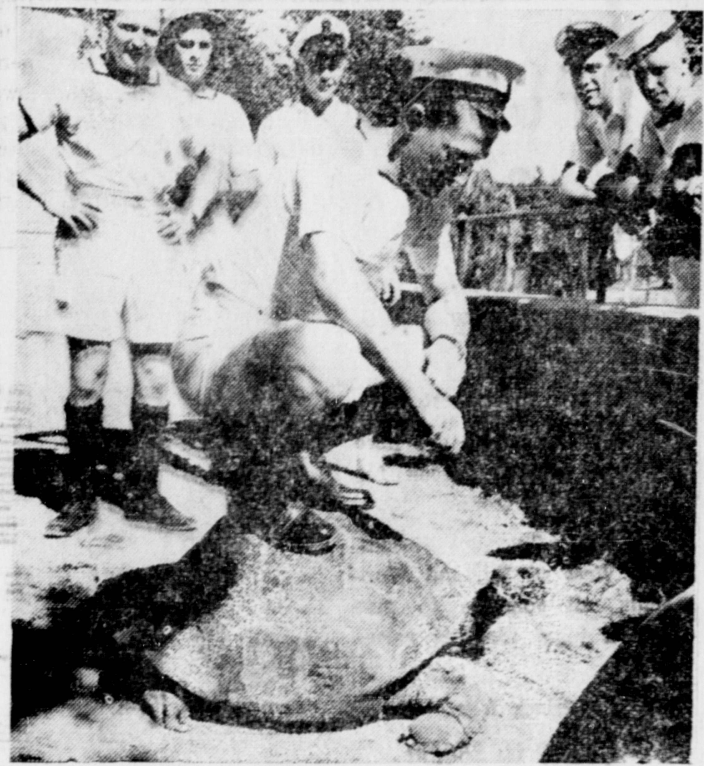
SAILORS AND TURTLE —The Galapagos turtle shown here is a long way from home and so are the Canadians pictured with it. The photograph was taken at the Bermuda museum. Last summer scores of University Naval Training Division men visited Bermuda on training cruises.