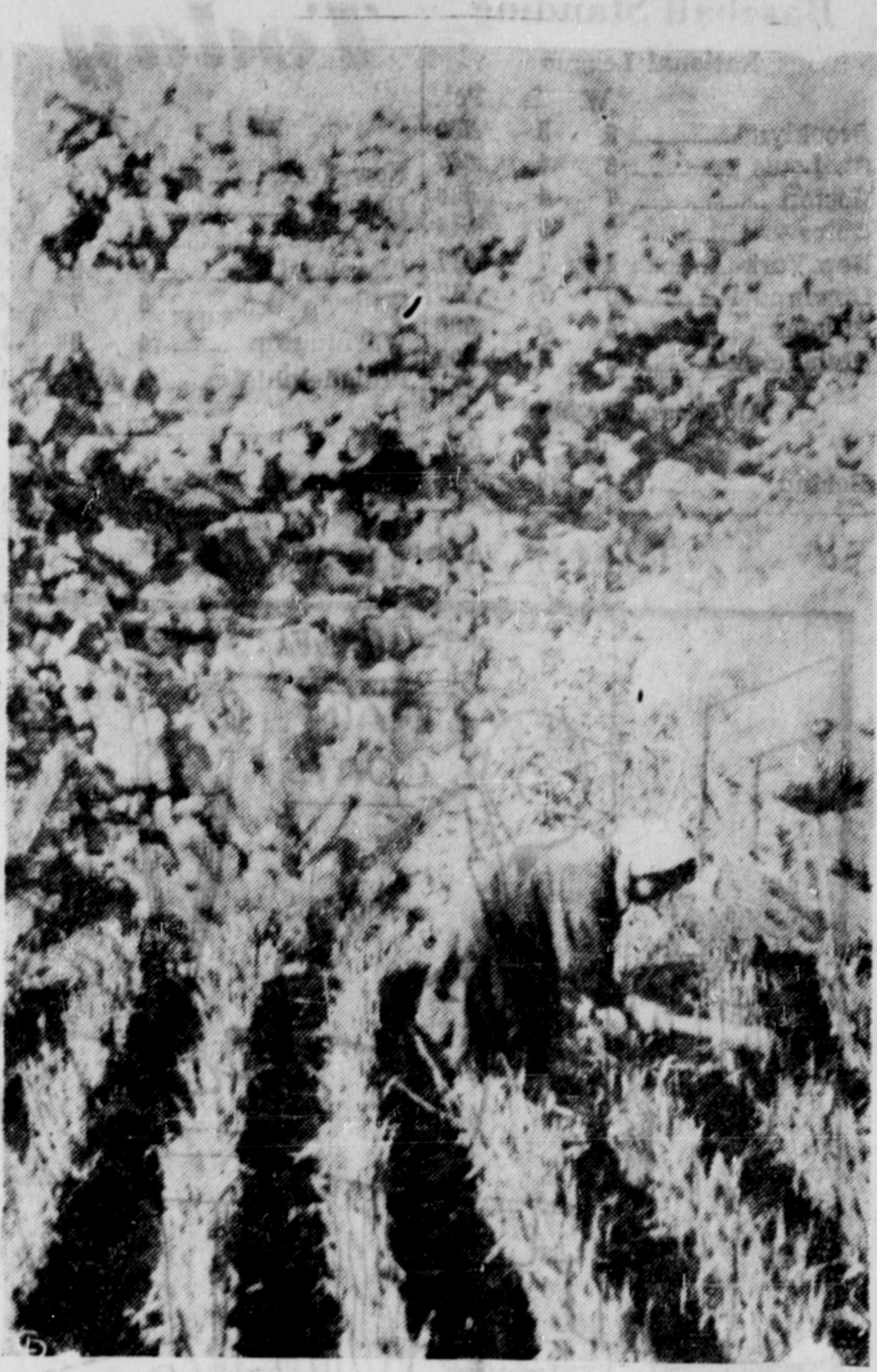
LAVA OVERFLOWS CROPS—A Japanese woman, native of the slopes of Sakurajima in Kagoshima Bay, with true Oriental fatalism, continues to hoe and cultivate her oats crop while river of lava is 50 feet behind her. Two days later this plot she works in was completely covered with molten rock.