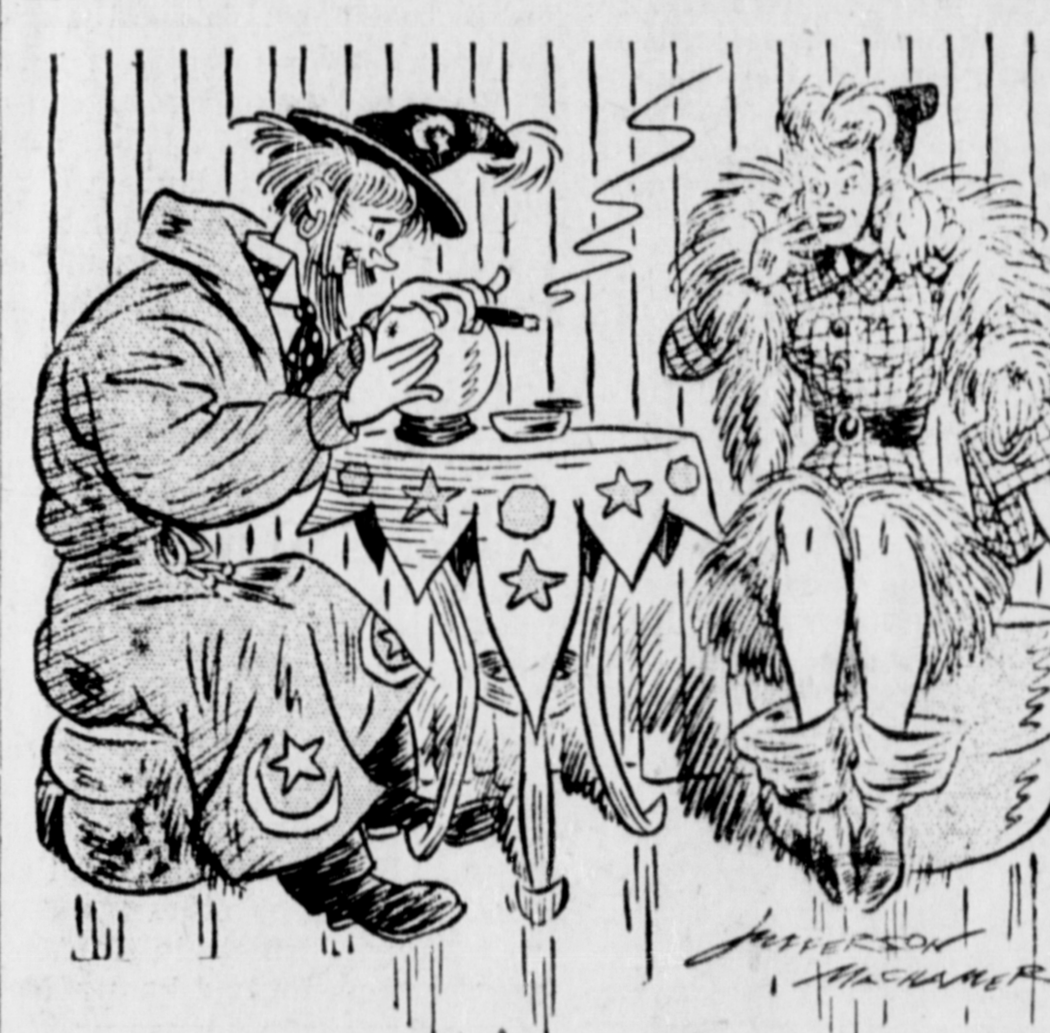
"I see a tall, intelligent, virile, handsome, dark, smiling man at breakfast with you—drinking Fort Garry Coffee!"

younger members of the church took an active part in the service.