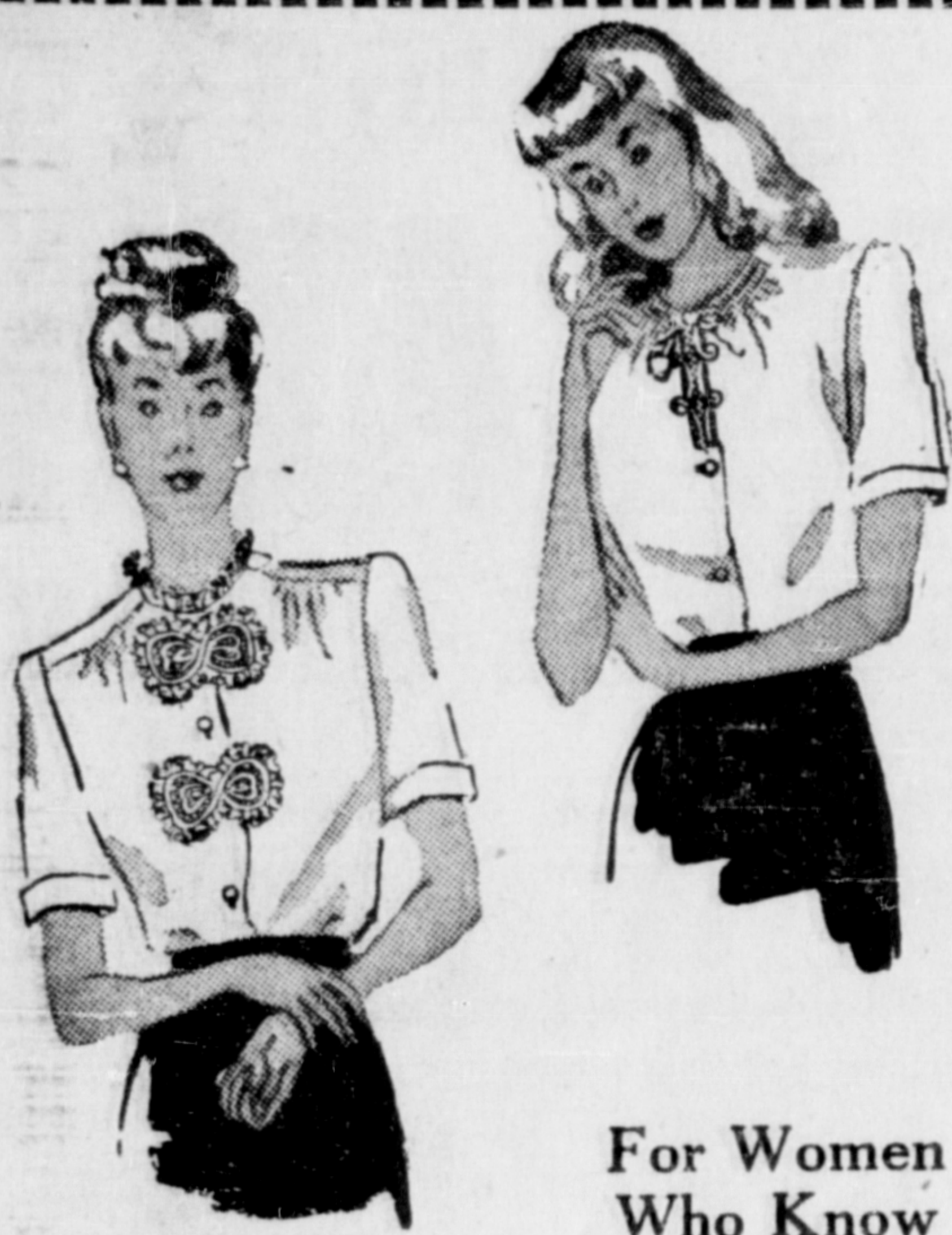
For Women Who Know