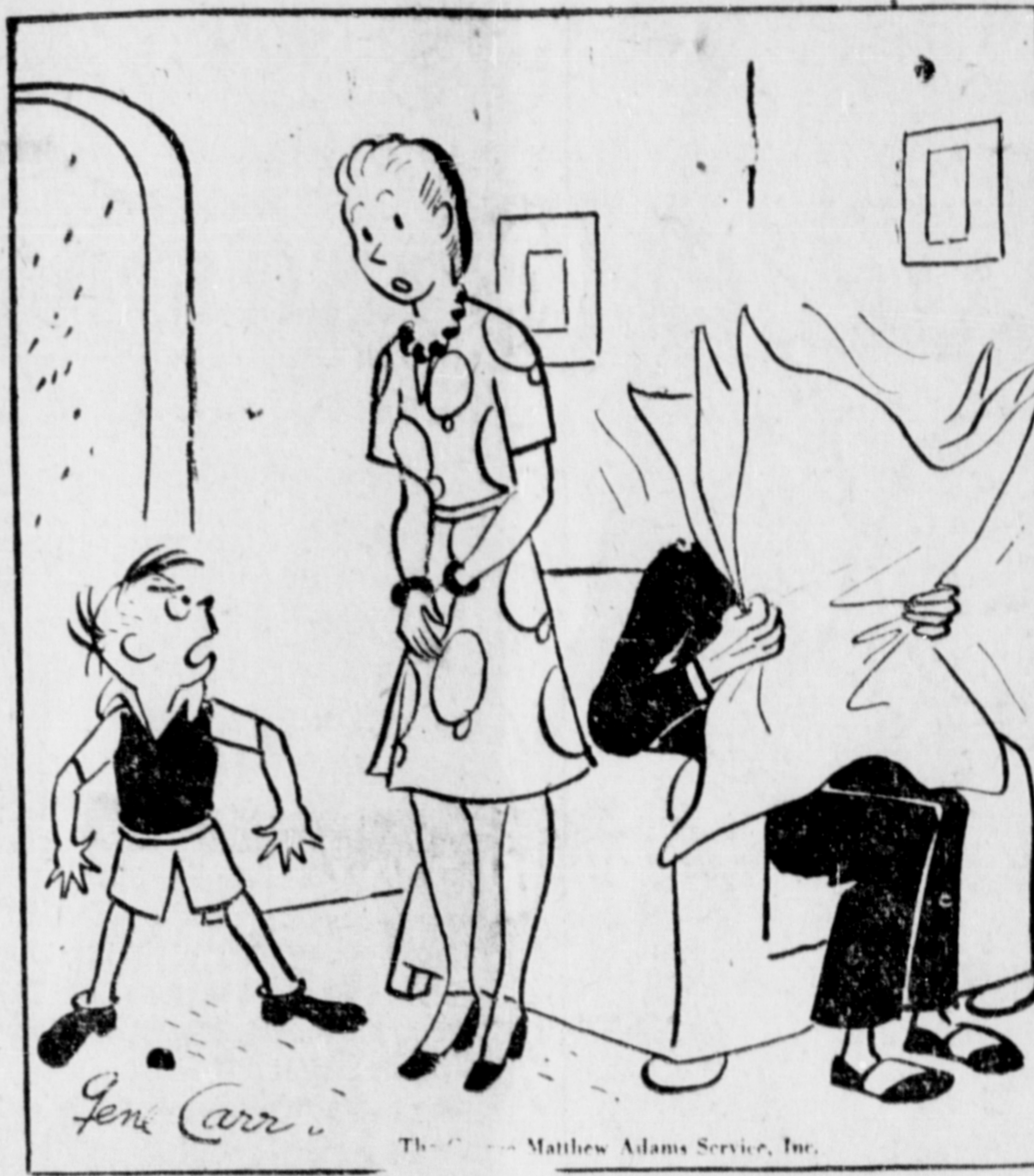
Why is it—whenever pop can't answer my questions, it's always time for me to say my prayers and go to bed?