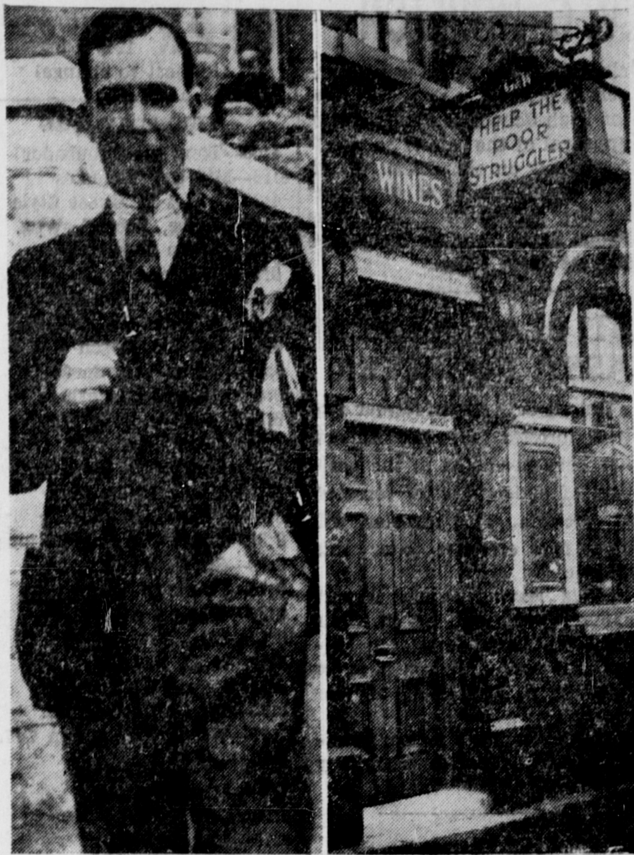
WILL HE EXECUTE NAZI WAR CRIMINALS? —Shown on the left is Albert Pierrpoint, Britain's public executioner and landlord of the public house "Help the Poor Struggler" between Manchester and Oldham, Eng.

MELBOURNE, Australia — There's a professional finish to the 4,000 tons of dripping shipped by members of the Victoria Housewives' Association to overseas countries needing fats. The association's club rooms are now a pocket edition of a factory, where fat contributed by housewives throughout the state is clarified, rendered and canned on the spot with a handy little home canning machine which was lent to the association.