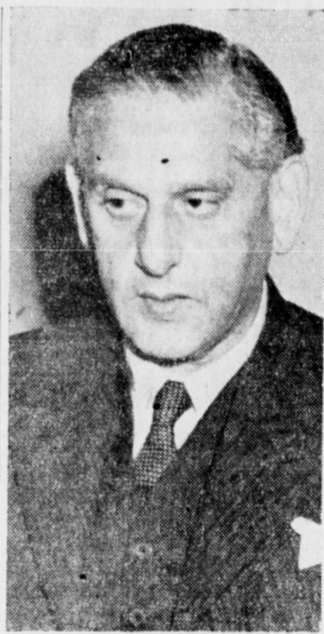
R.T. HON. LEWIS SILKIN, British minister of town and country planning.