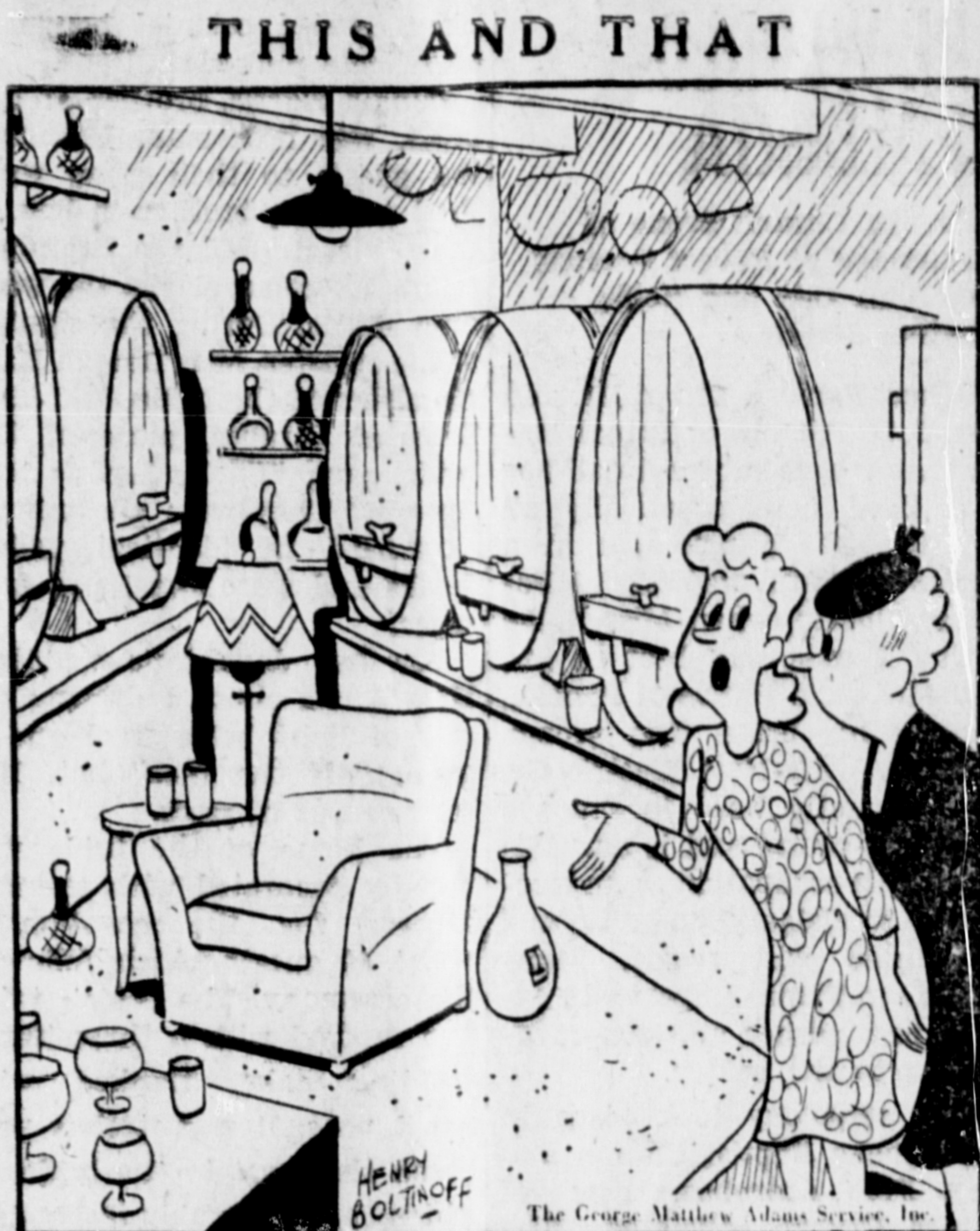
"This is my husband's den!"