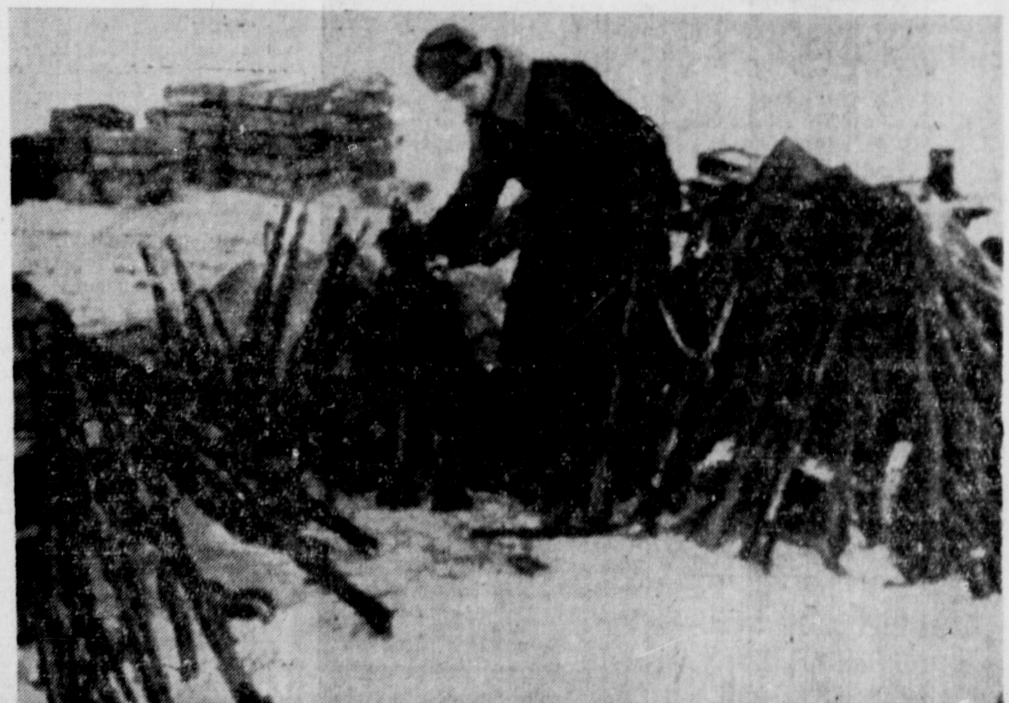
HERE IS PROOF GERMANS Routed in NORTH RUSSIA—A Red Army soldier shown inspecting the arms and ammunition left behind by the German garrison in Zakhody, U.S.S.R., when they fled the onslaught of Russian winter troops. This is in the Vitebsk region, to the east of the Baltic States.