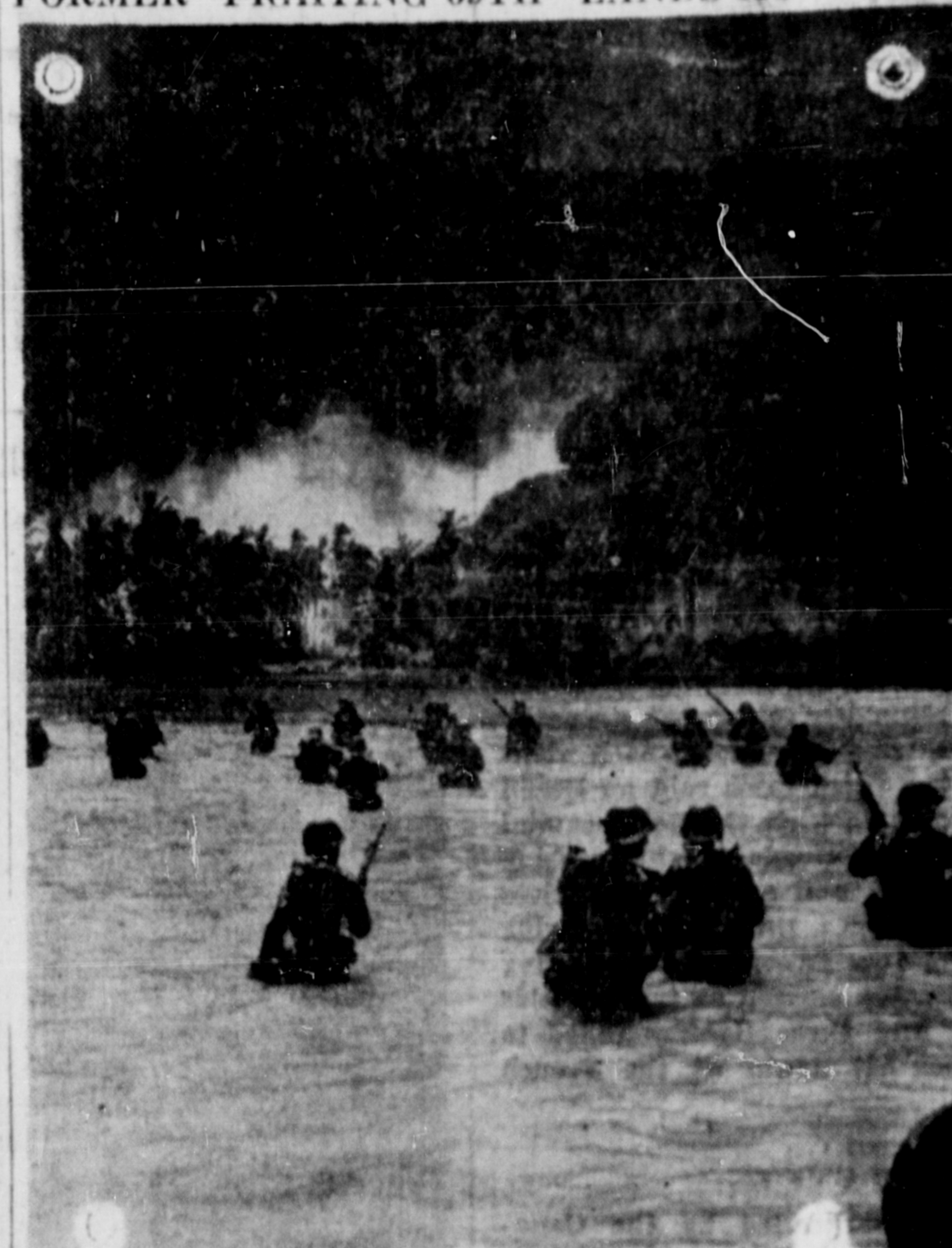
Troops of the 165th U.S. Infantry, New York's former "Fighting 69th," advance toward Japanese beach positions on Burartaria Beach, Makin Island. The beach positions are blazing from direct hits made by American naval forces. Medium tanks have already reached the shore and are busy cleaning out enemy machine-gun positions.