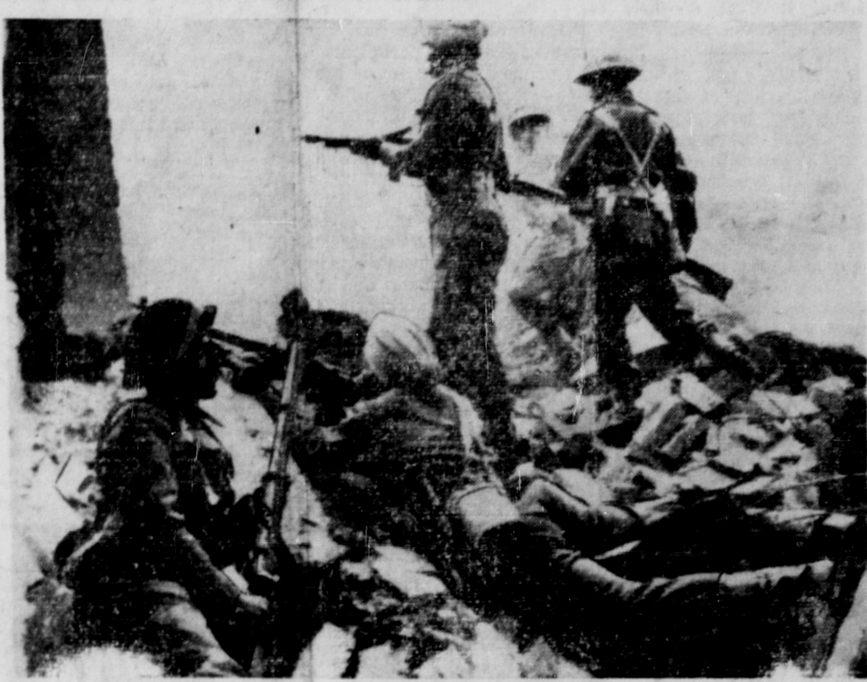
INDIAN FIGHTERS ARE FIERCE AND DAUNTLESS—A Bren gunner is giving covering fire while a section of Indian troops moves forward under cover of smoke through demolished buildings on the British Eighth Army front in Italy. This town was under heavy fire from German mortars when the photo was taken.

LONDON, Jan. 12—A 100-year old woman who did not know that there was a war on has died in Warwickshire in central England. Her family saw to it that she did not read the newspapers or hear the radio.