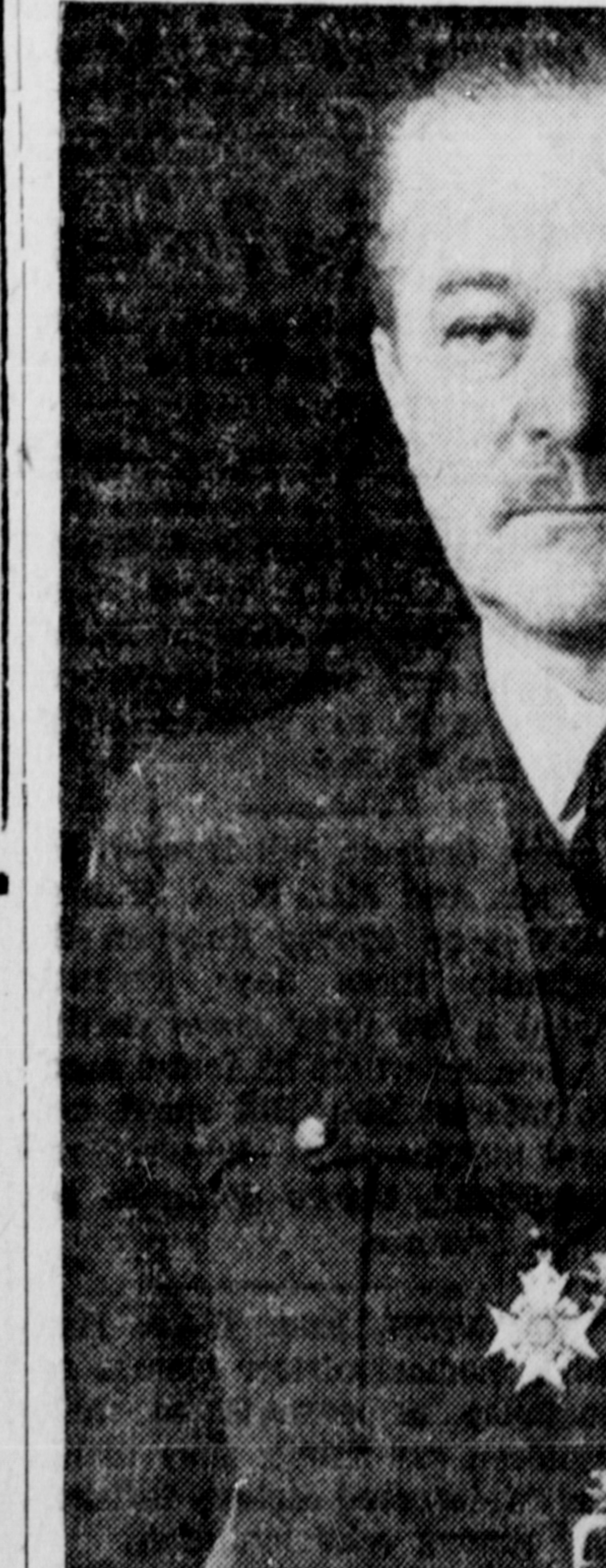
Air Marshal W. A. Bishop who is officially credited with shooting down 72 enemy aircraft in the last war and who served with distinction in this war as Director of Air Force Recruiting, is shown here shortly after he received from the Governor-General the insignia of a Companion of the Most Honorable Order of the Bath at a private investiture at Ottawa, Nov. 23, 1944. The award was made in the King's birthday honors list in June, 1944.