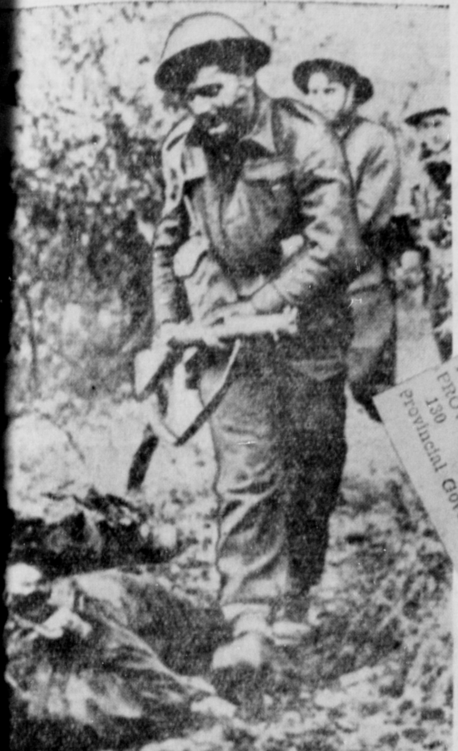
NAZIS PERISH—A British paratrooper looks down at the bodies of two Germans whom he and his comrades had just killed on the Garigliano front, Italy.