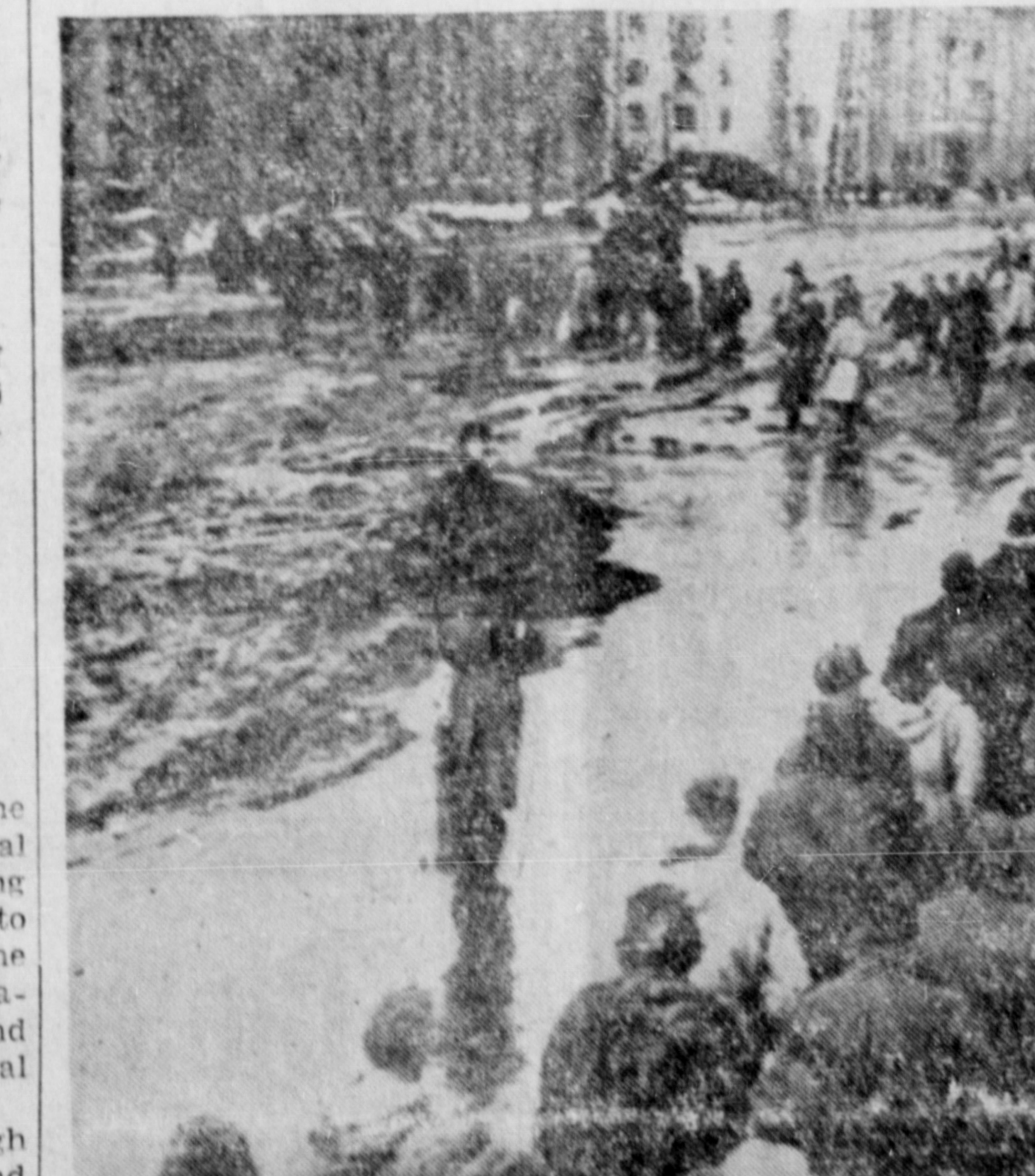
THESE NAZIS WON'T FIGHT AGAIN FOR HITLER—This radiophoto, received from Russia, shows a long column of German soldiers being marched through the streets of Leningrad after their capture in the successful westward drive to relief of the besieged city.