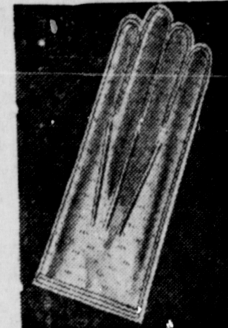
"THE MEN'S SHOP"

Watts & Nickerson MEN'S and BOYS' CLOTHING PHONE 345 — FIVE-THREE-TWO THIRD AVENUE