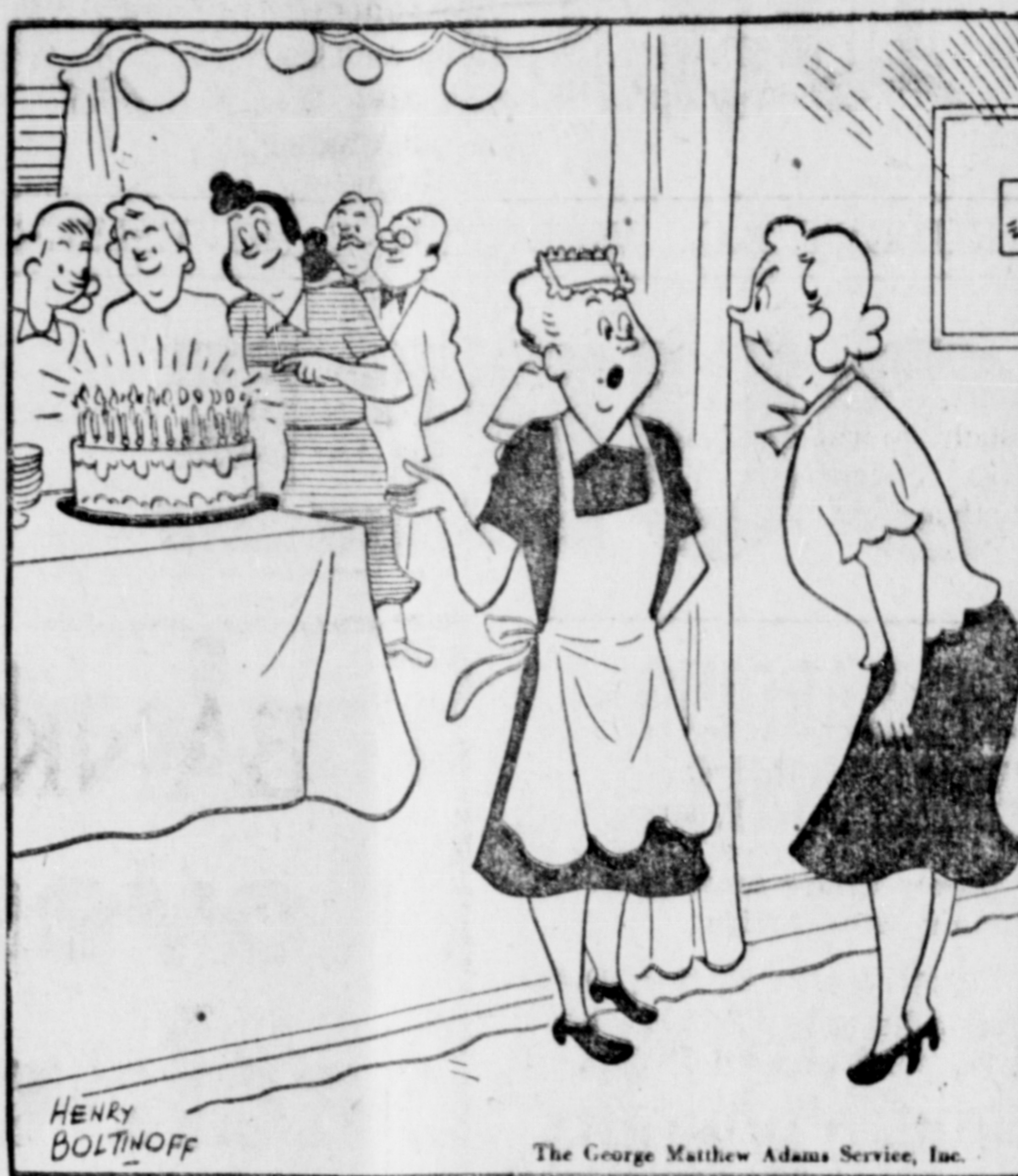
"I had a lot of candies, so I stuck 'em all in your birthday cake."