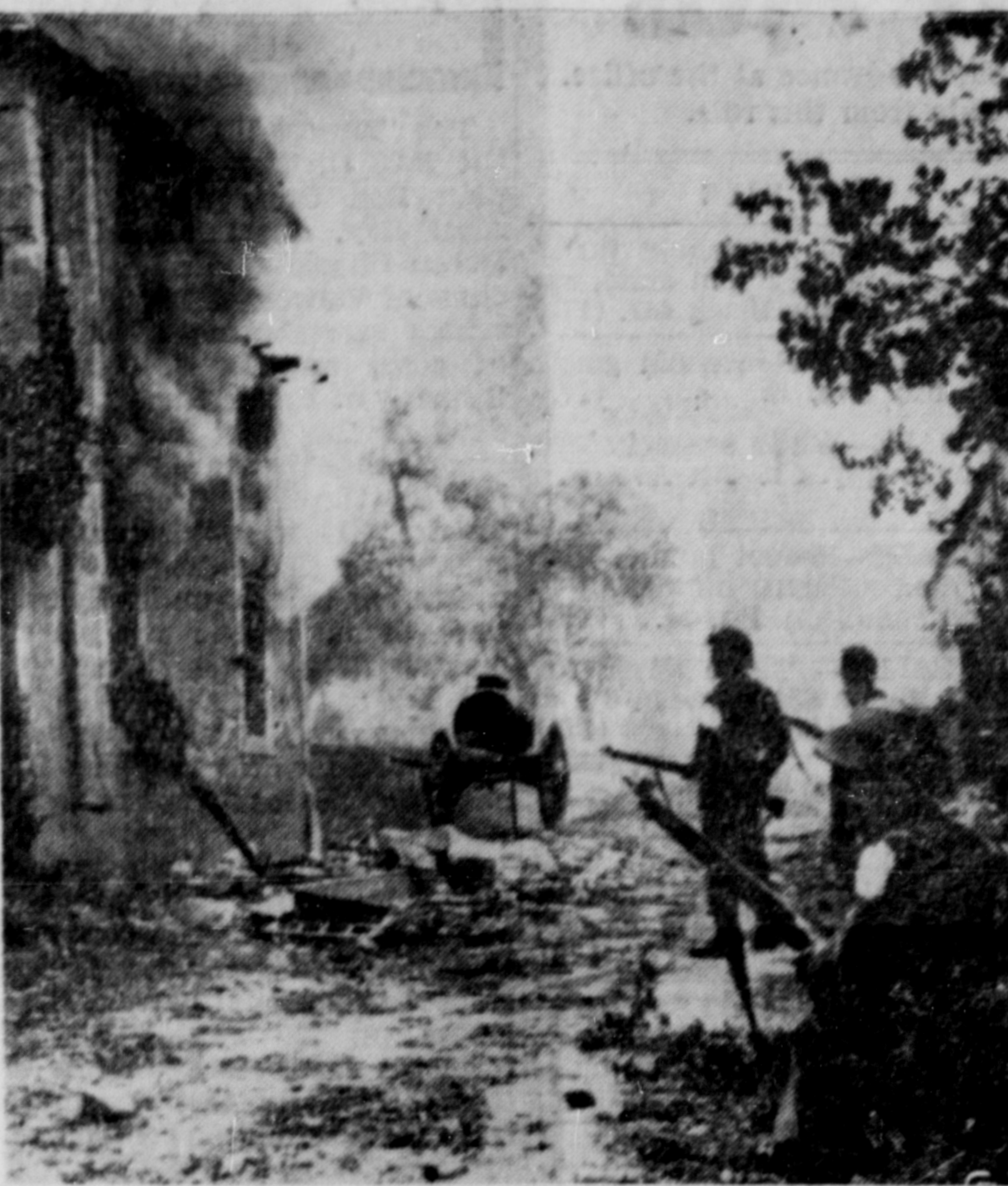
SMOKING OUT A SNIPER — Rifles ready, British Tommies wait for German snipers who had holed up in this farm near Tilly-Sur Seules, France, to make a break as the building burns. This was in the village of Christot, where the Germans left many snipers to harry the pursuing Tommies driving for Tilly.