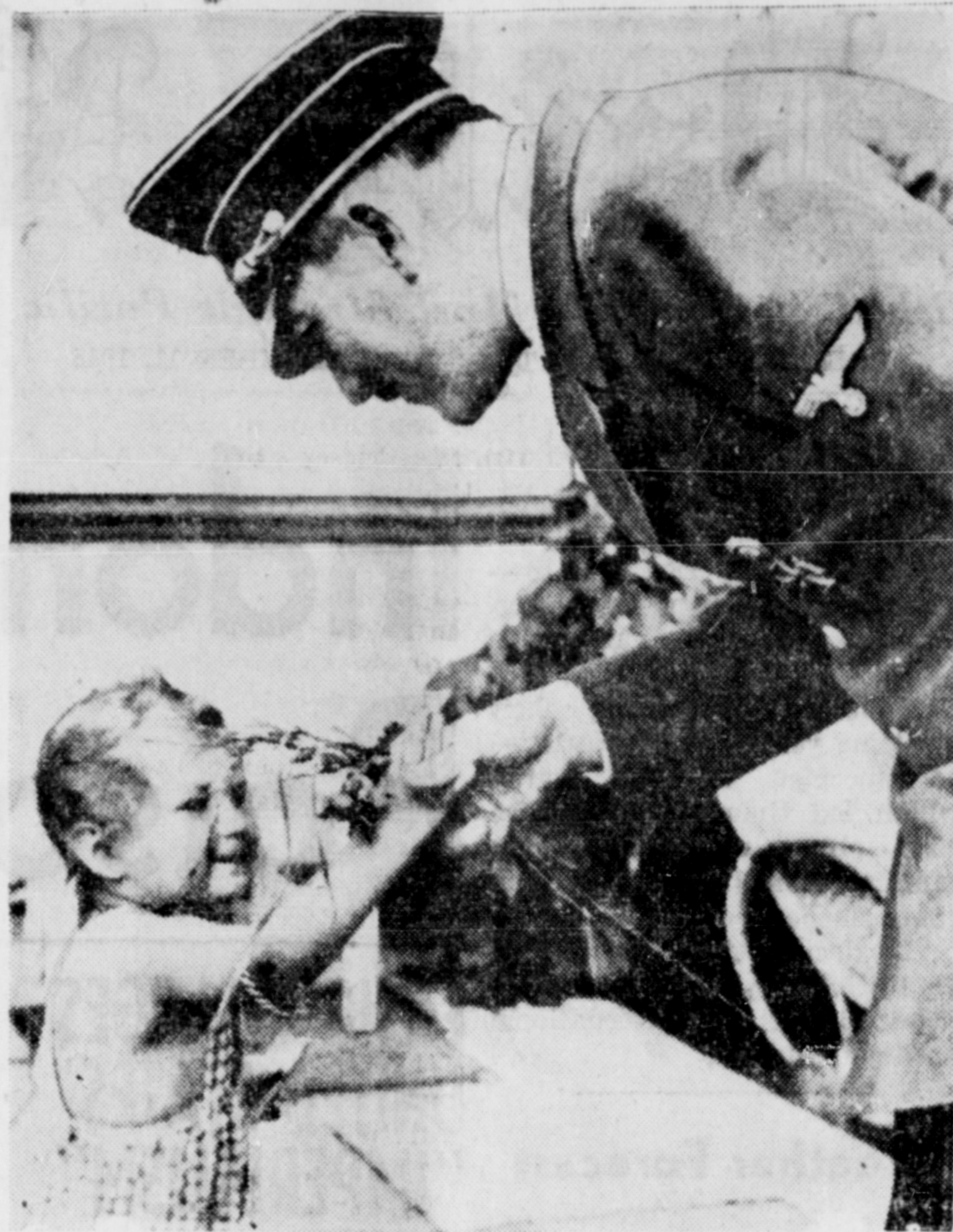
FLOWERS FOR "UNCLE ADOLF" — This photo was among several effects of Eva Braun, reputed to have been Hitler's mistress. The child giving the flowers to the late, unlamented Fuehrer is believed to be the daughter of a sister of Eva Braun.

Undoubtedly the most graphic and comprehensive pictorial document of the recent war to be shown to date is "The True Glory," a filmed chronology of those great events of fighting which took place between "D" Day and "V-E" Day in Western Europe. From the picture can be more fully appreciated the cast and almost miraculous co-ordinated massing of fighting power which started on June 6, 1944, with the operation of Mulberry on the beach of Normandy through Caen, Falaise, St. Lo, Rheims and the other great battles up to the final victory across the Rhine on May 7, 1945. To accomplish this is an ingenious pany the picturization of the various method of narrative in which fighting men of various nations and races from the London Cockney to the Harlem negro tell the story in sequences. The picture, which opened yesterday at the Capitol Theatre and concludes today, should be seen by all who wish to be up to date on the war story.