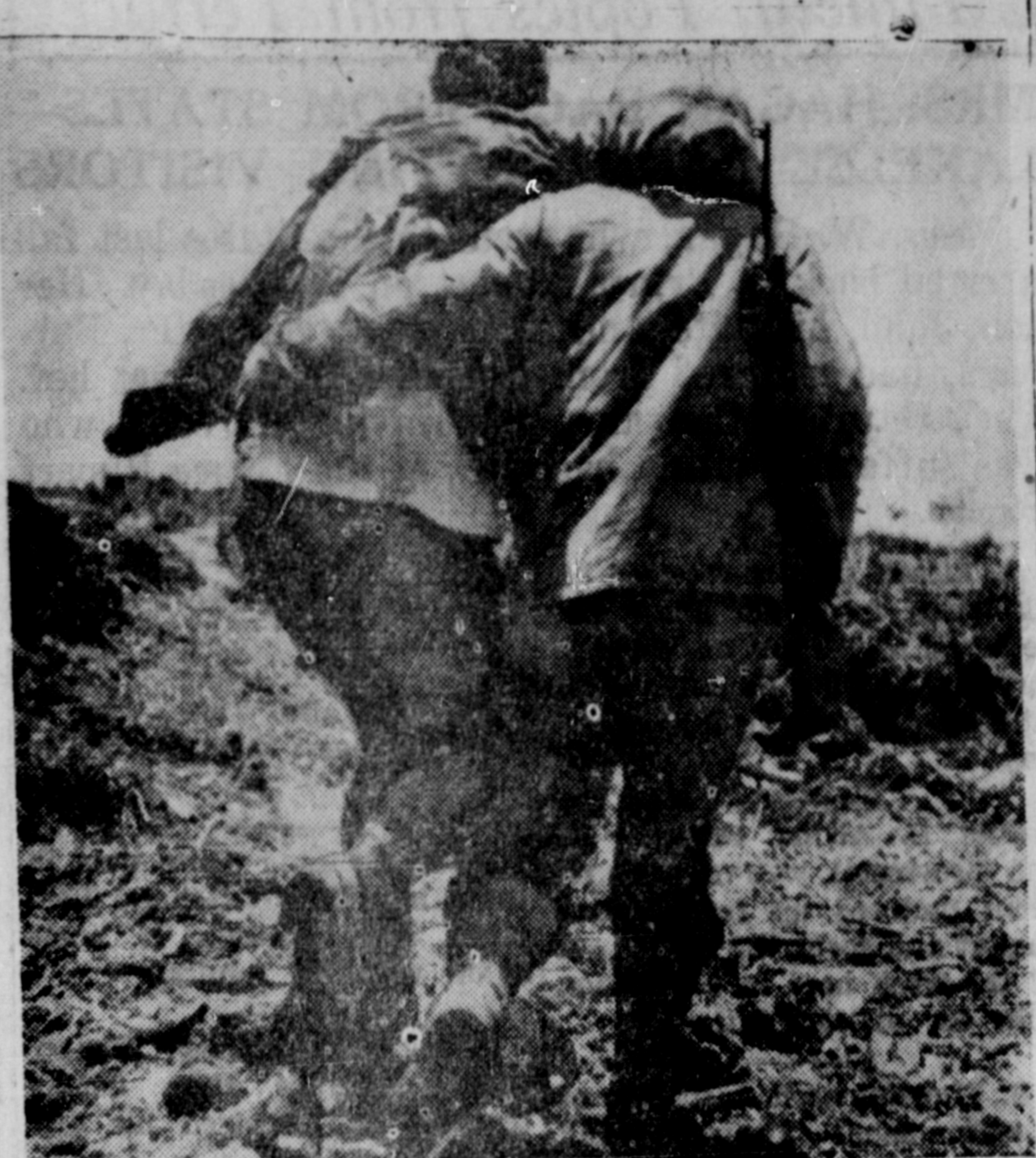
V-E DAY ON OKINAWA—These marines fighting the bloody battle for Okinawa observed V-E Day in this manner. At the left is the marine who had his clothes blown from his back by a Jap mortar shell. Shocked and hurt, but still on his feet, he is helped toward the rear by a companion.