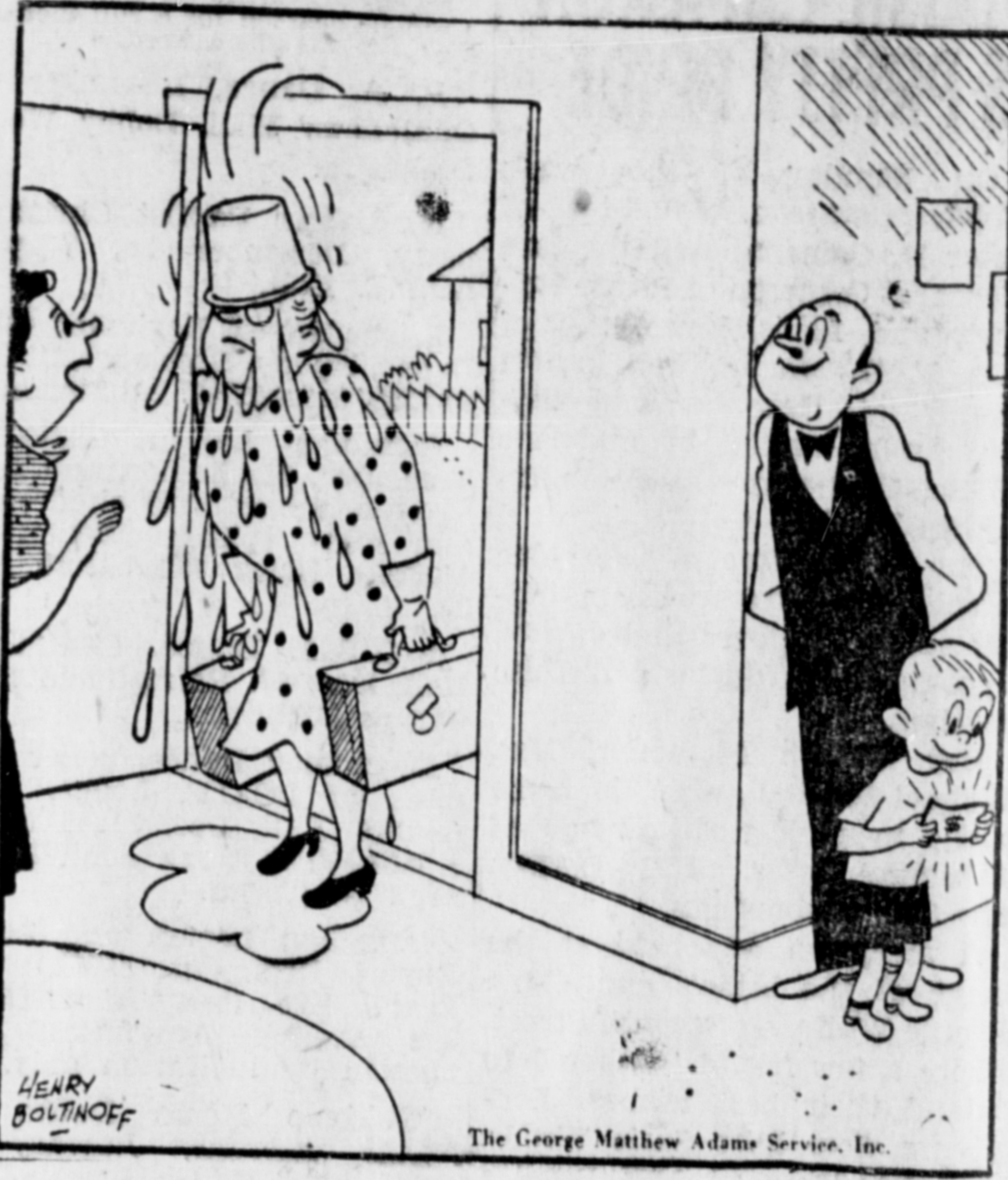
"Oh, Mother! I don't know what Junior will be up to next!"