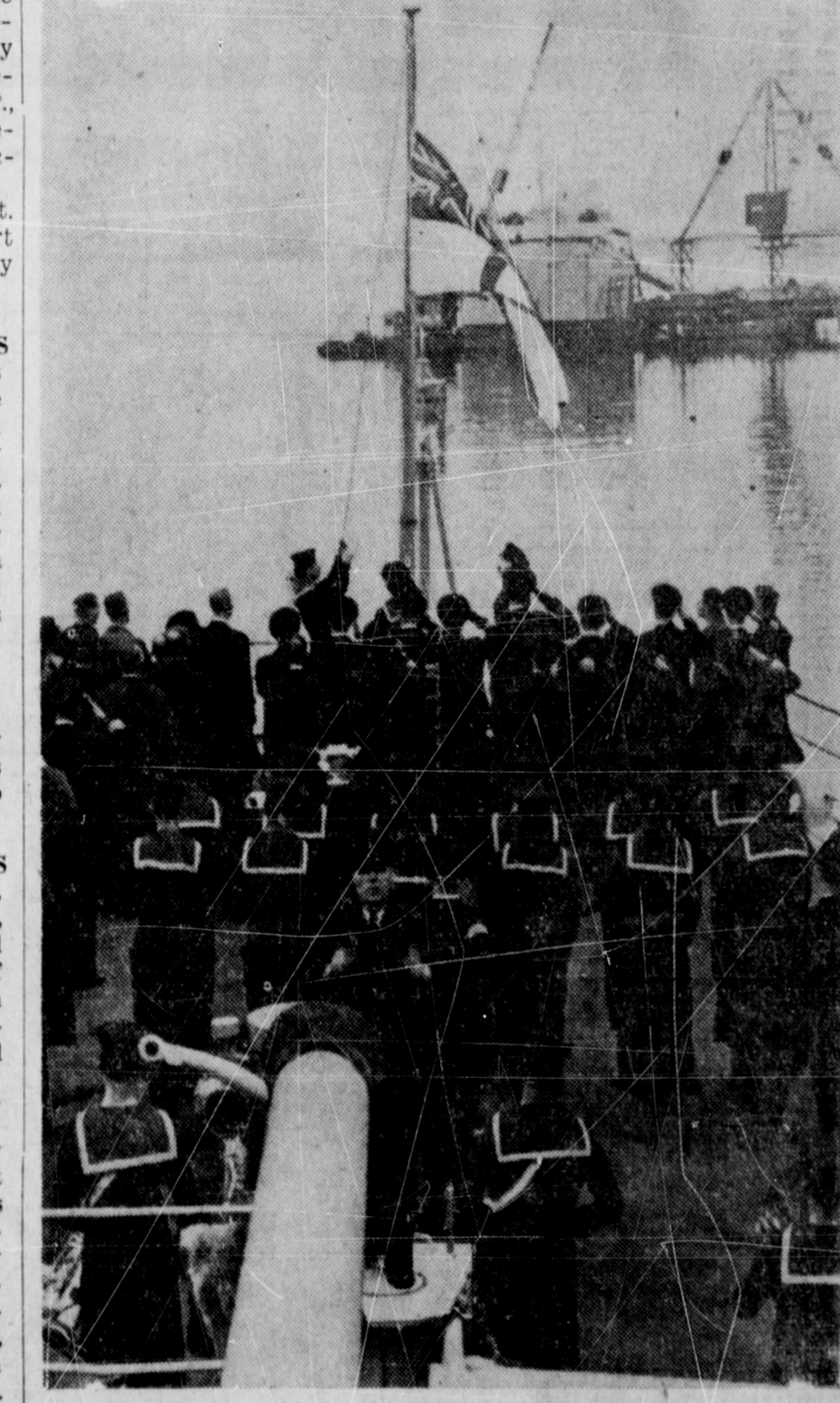
H.M.C.S. ONTARIO NEW CANADIAN CRUISER IS COMMISSIONED—The ship's company stands at attention and officers of H.M.C.S. Ontario stand at salute as the Ensign is hoisted during commissioning ceremonies of this sister ship of the Uganda.

SAN FRANCISCO, July 7 (C. Shipping movements in the harbor at Sydney, Australia, were halted from Thursday night to Friday morning because of reported enemy action along the coast, the Melbourne radio reported today.