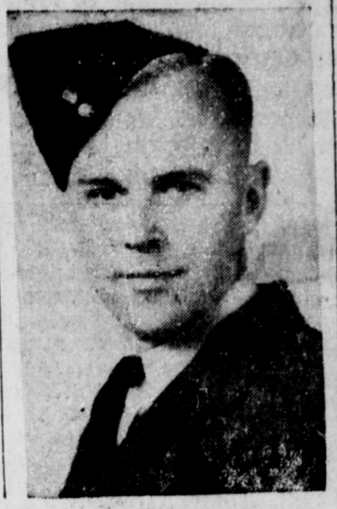
LAC HARRY ARCHIBALD