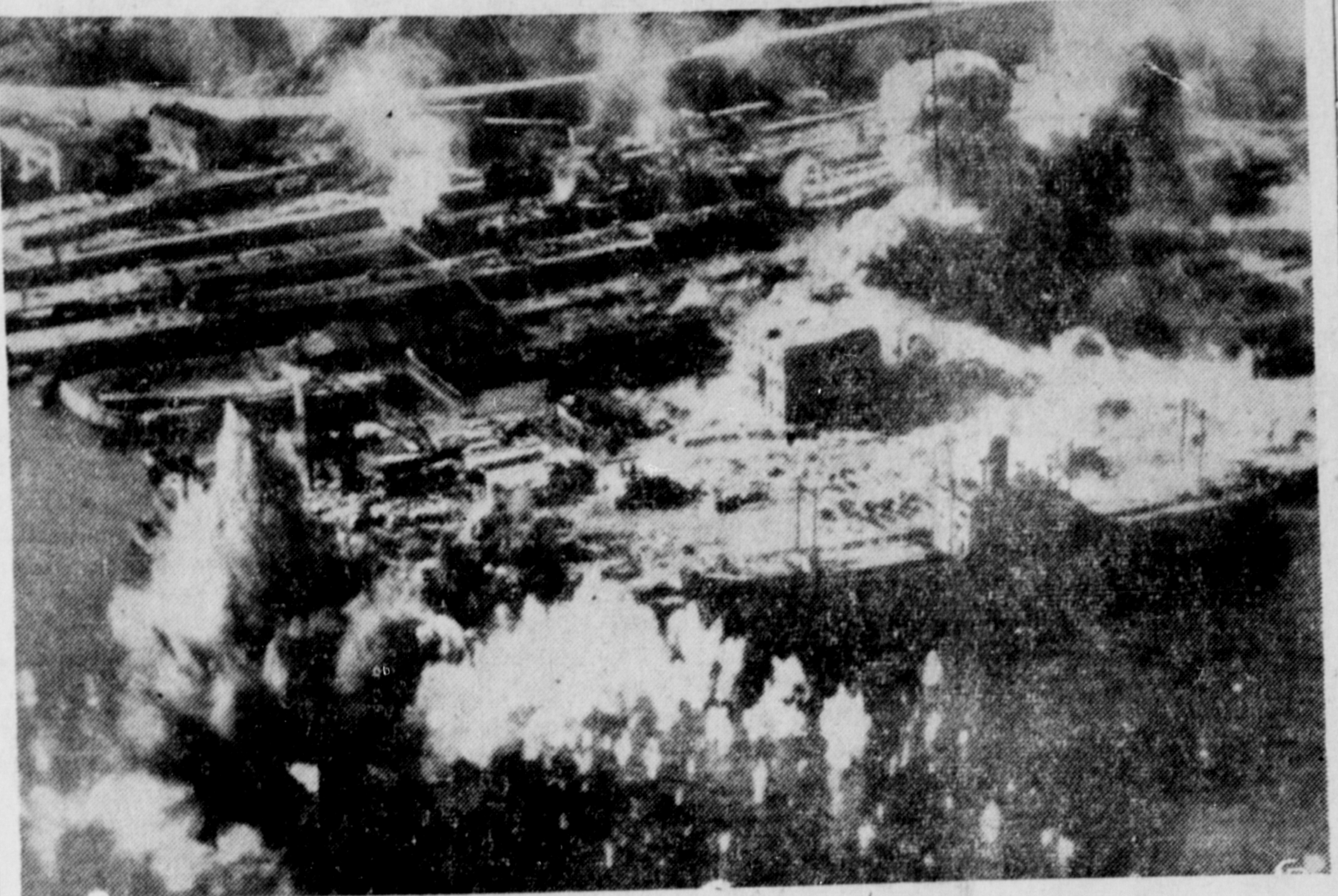
ALLIED PLANES BOMB DOCKYARD AT HONG KONG—Here is Taikoo dockyard in Hong Kong, China, under attack Jan. 16 by U.S. navy planes of Vice-Admiral John S. McCain's fast carrier task force. Bomb explosion to the left set afire a 4,500-ton freighter-transport ship. Smoke and fire to the right are rising from a direct hit on the machine shops. Air-men here encountered some of the heaviest anti-aircraft fire yet seen in the Pacific theatre.

HUNDRED AND FOURTY BUSINESS SCKS OF TOKYO ARE BURNED OUT AM, Feb. 28 (CP)—Office quarters United States Twenty-First Command have revealed the results of B-29 Tokyo. The fleet of 200 super B-29s levelling the centre of Tokyo's industrial and factory and business district having been