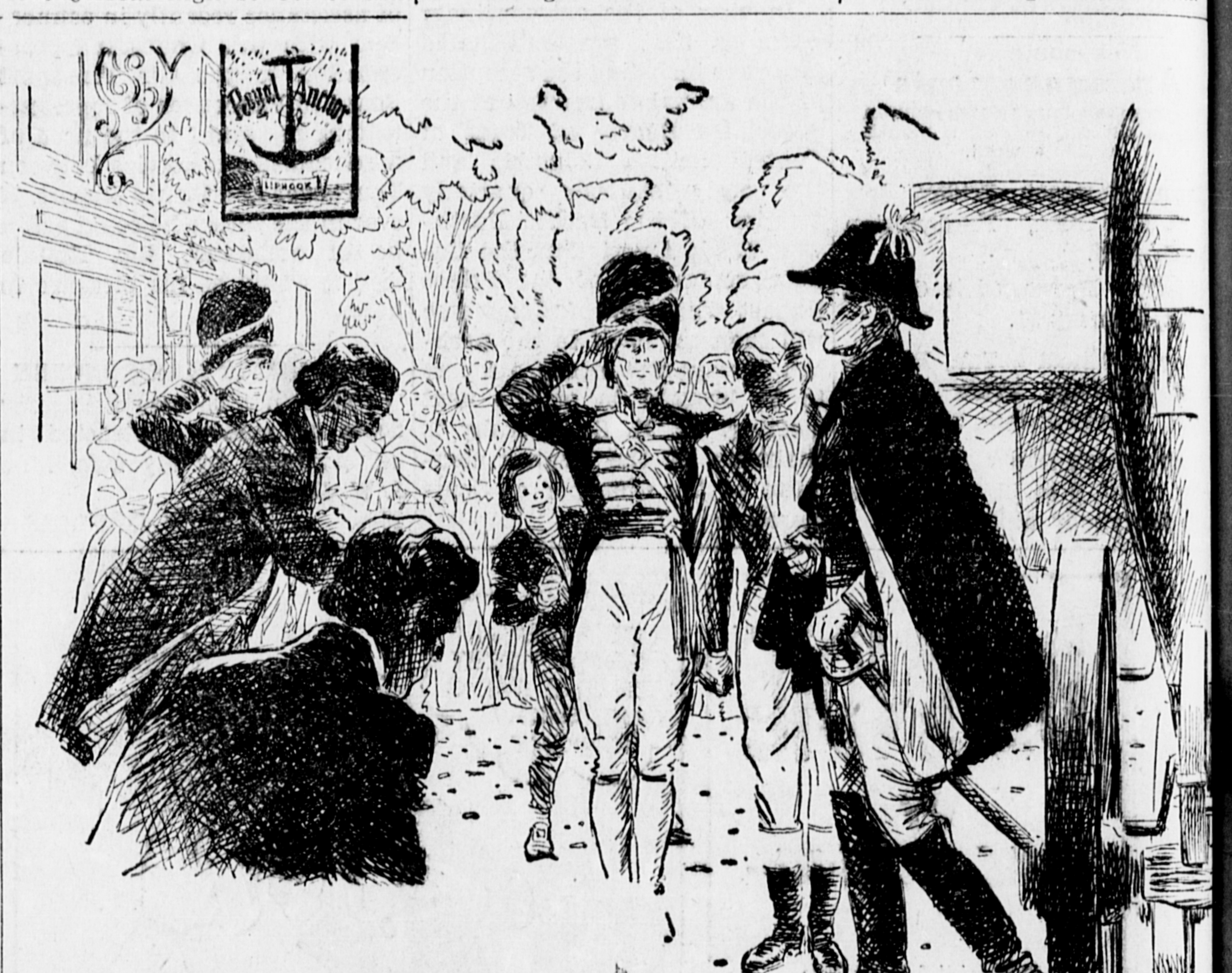
After Waterloo... Supper at The Anchor