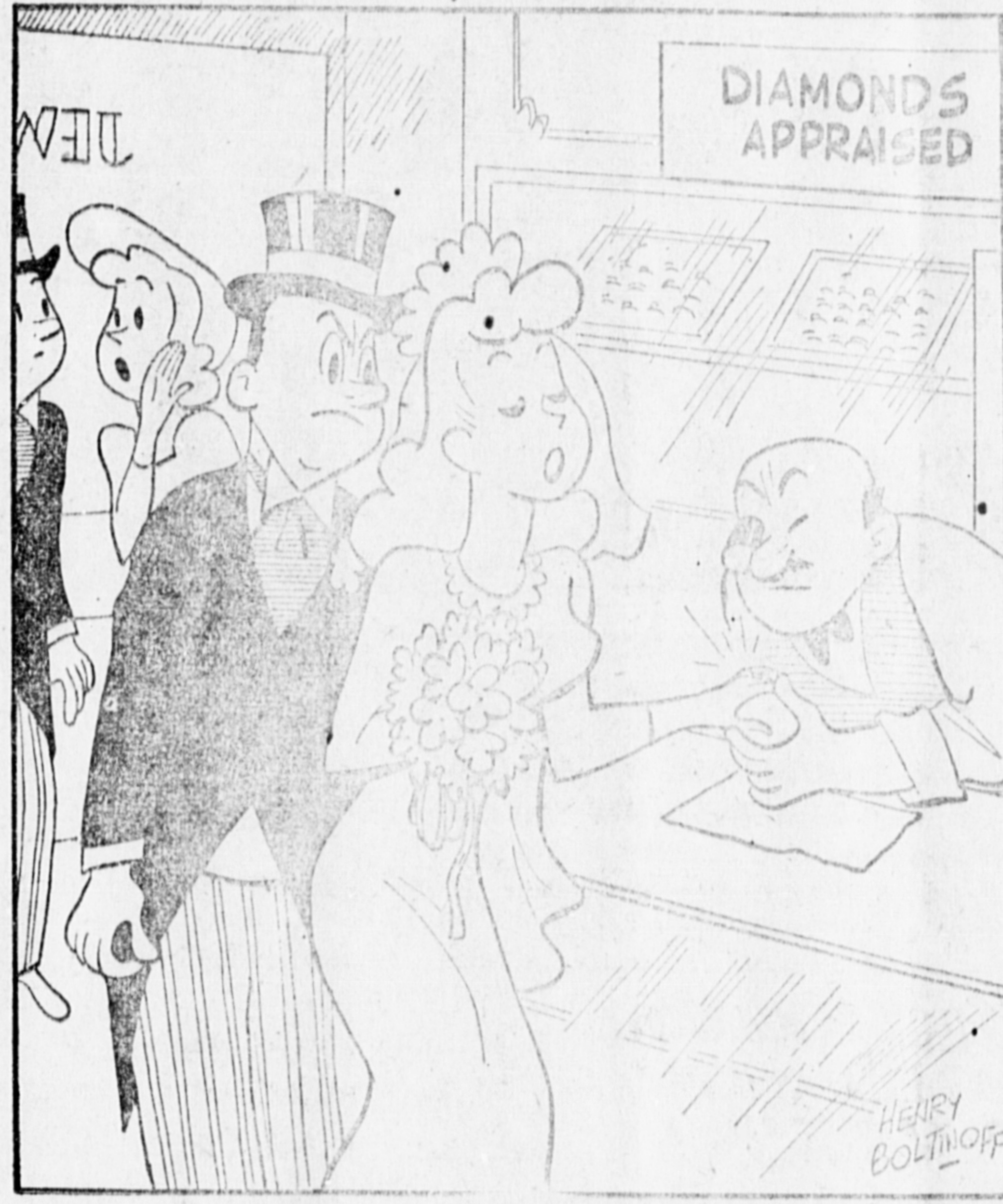
"She never takes a chance on anything!"