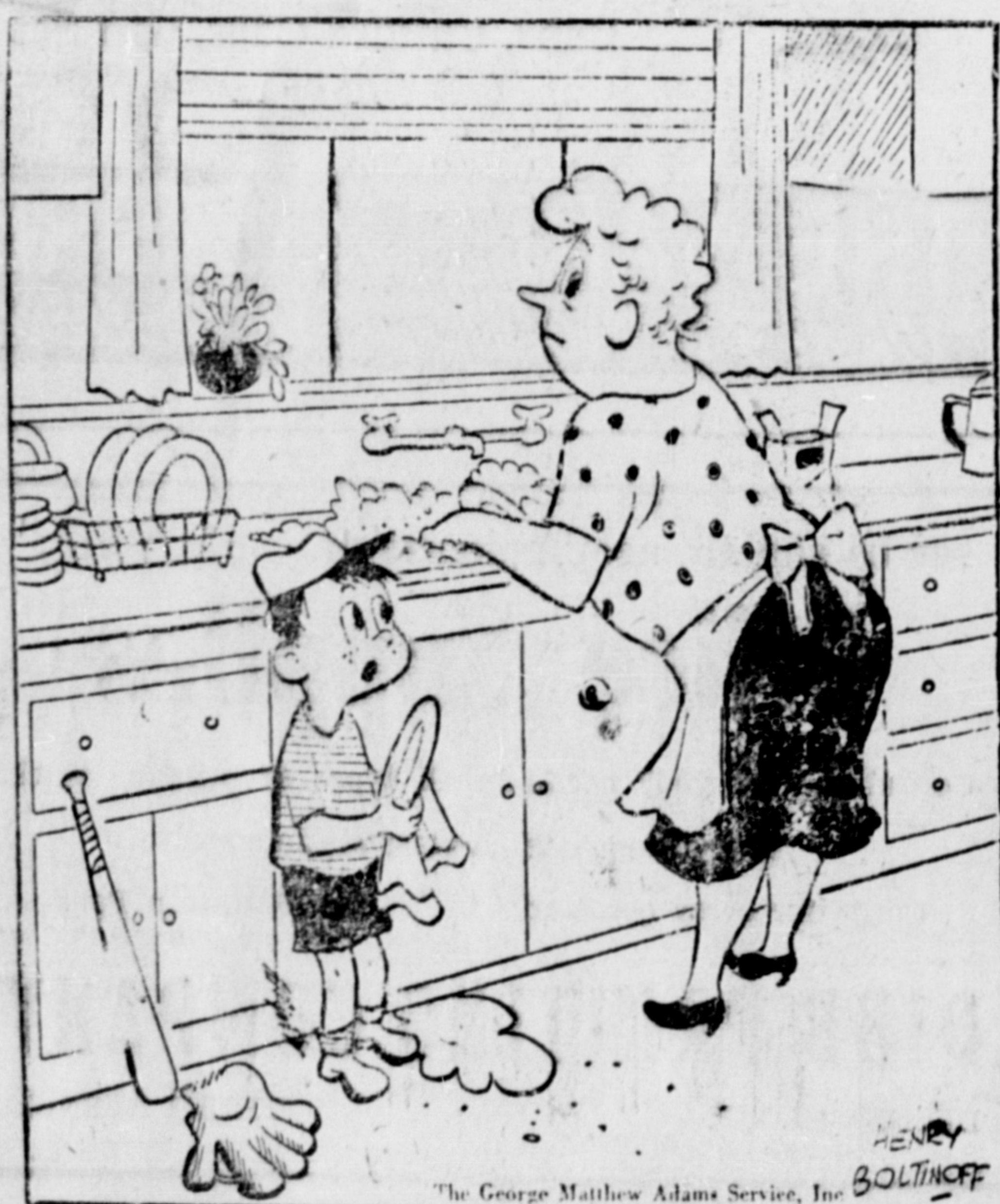
"Say, Mom, did ya ever think of havin' another child—a girl, maybe?"